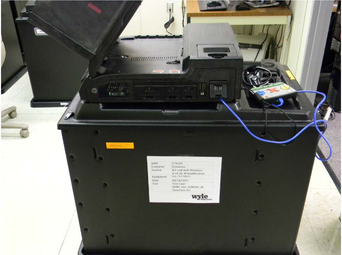
Photograph 13 ICE Functional Test Setup – IR Paper Detection