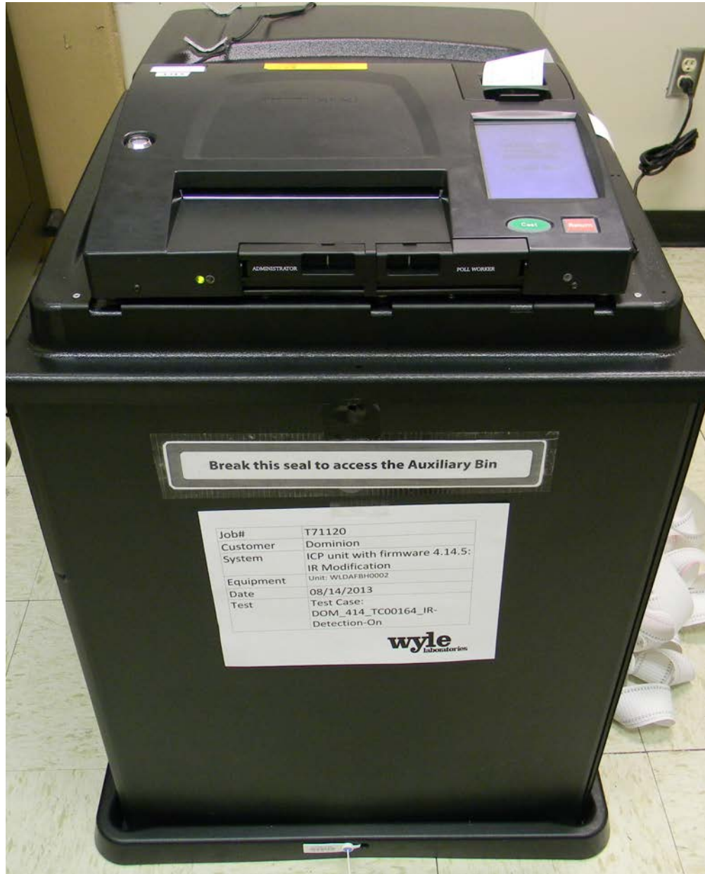
Photograph 14 ICP Functional Test Setup – IR Paper Detection