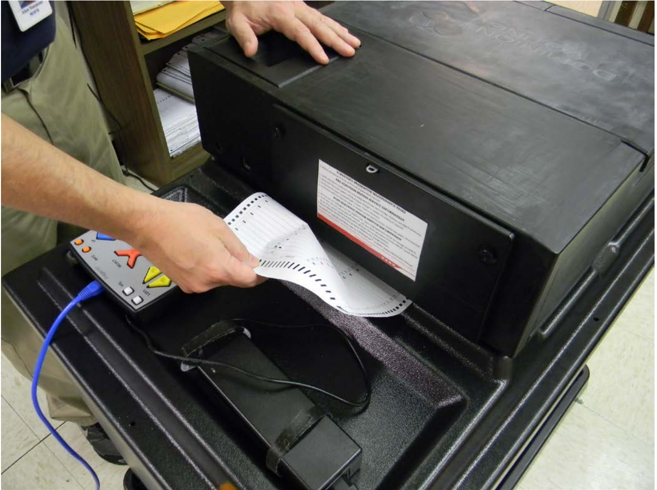
Photograph 6 ICE Ballot Box Security Testing – Attempting a security breach