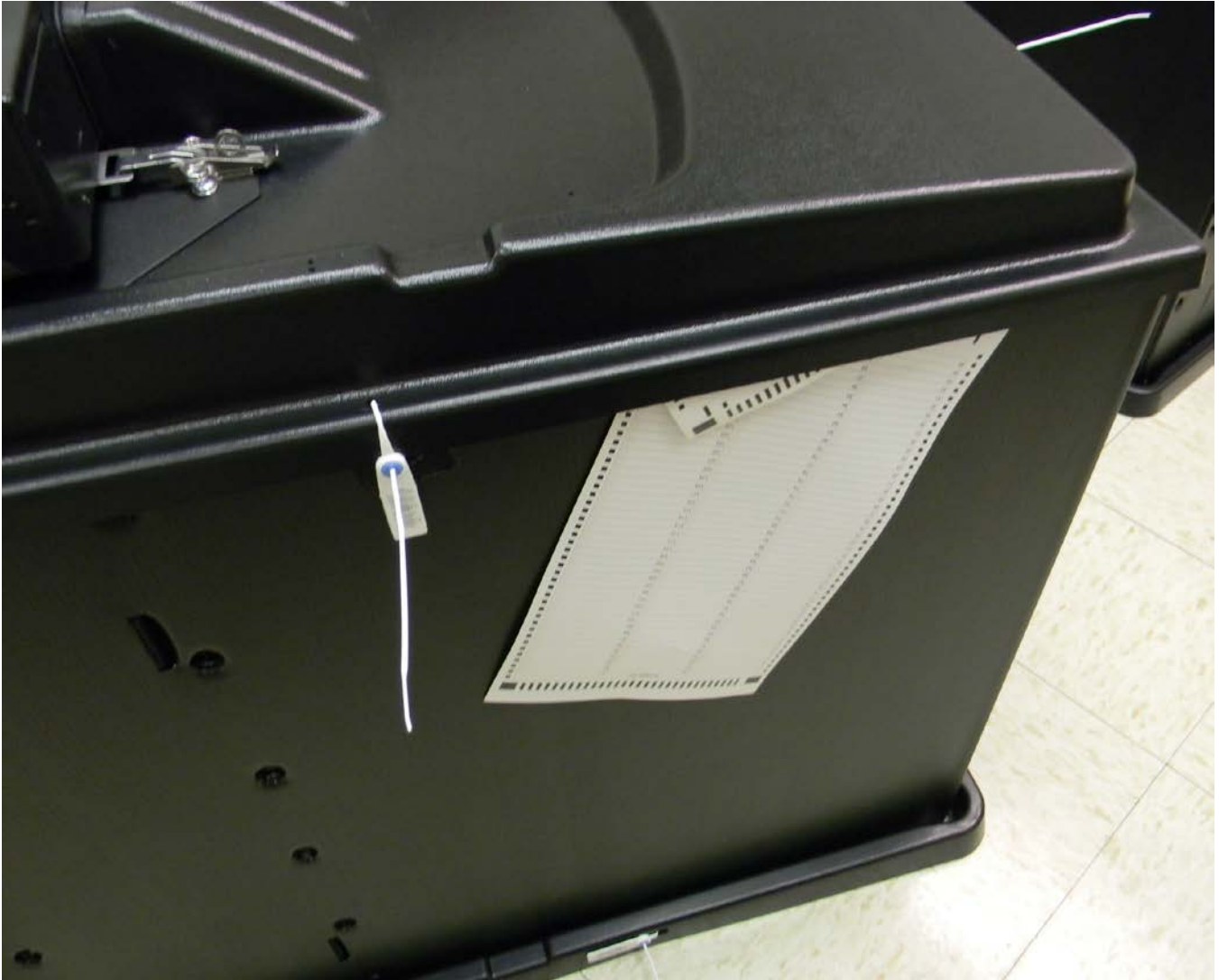
Photograph 7 ICP Ballot Box Security Testing – Attempting a security breach