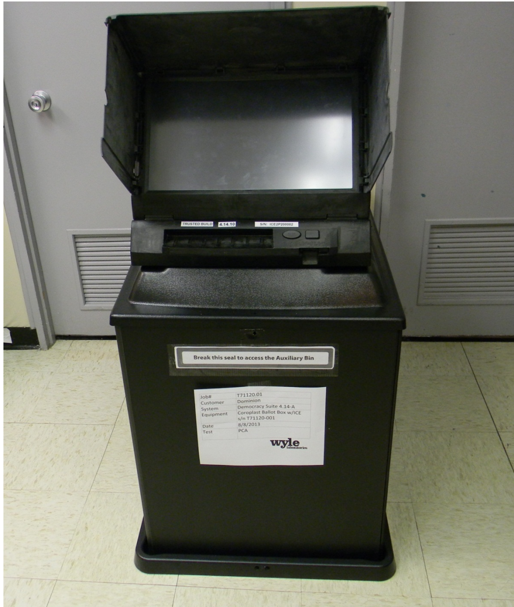
Photograph 1: ImageCast Evolution (ICE) on Coroplast Ballot Box

The Dominion Democracy Suite ImageCast Evolution system employs a precinct-level optical scan ballot counter (tabulator) in conjunction with an external plastic ballot box. This tabulator is designed to mark and/or scan paper ballots, interpret voting marks, communicate these interpretations back to the voter (either visually through the integrated LCD display or audibly via integrated headphones), and upon the voter's acceptance, deposit the ballots into the ballot box. The unit also features an Audio Tactile Interface (ATI) which permits voters who cannot negotiate a paper ballot to generate a synchronously human and machine-readable ballot from elector-input vote selections. In this sense, the ImageCast Evolution acts as a ballot marking device.