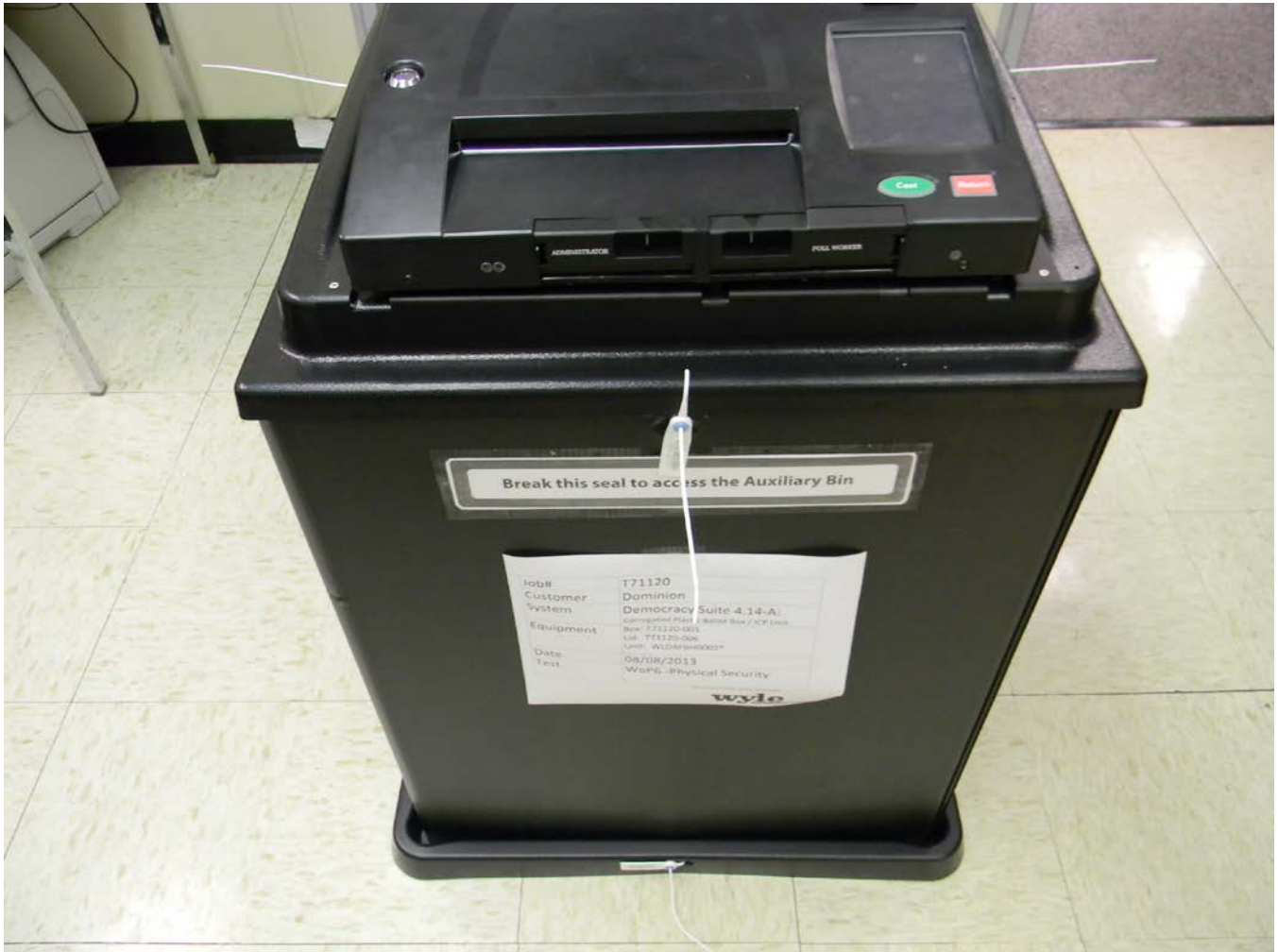
Photograph 5 ICP Security Test Setup