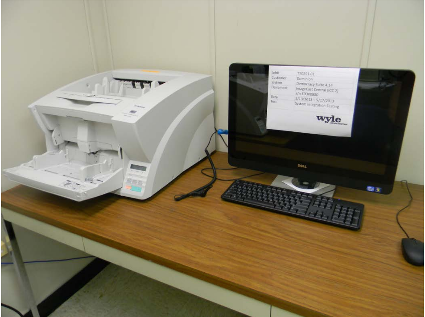
Photograph 15 ICC Functional Test Setup – IR Paper Detection