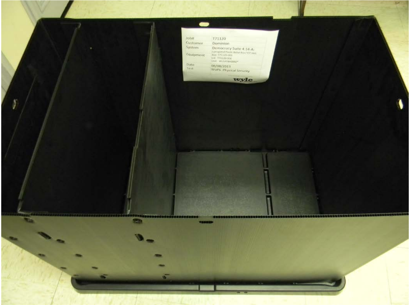
Photograph 9 ICP Coroplast Ballot Box – Internal Compartments