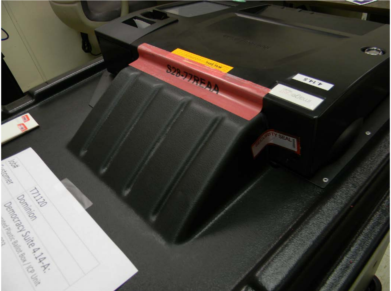
Photograph 11 ICP Coroplast Ballot Box without locking latch – Security Seals