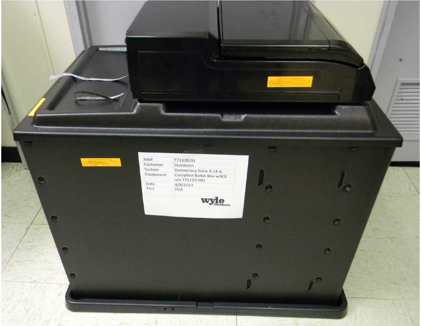
Photograph 1 ICE Coroplast Ballot Box