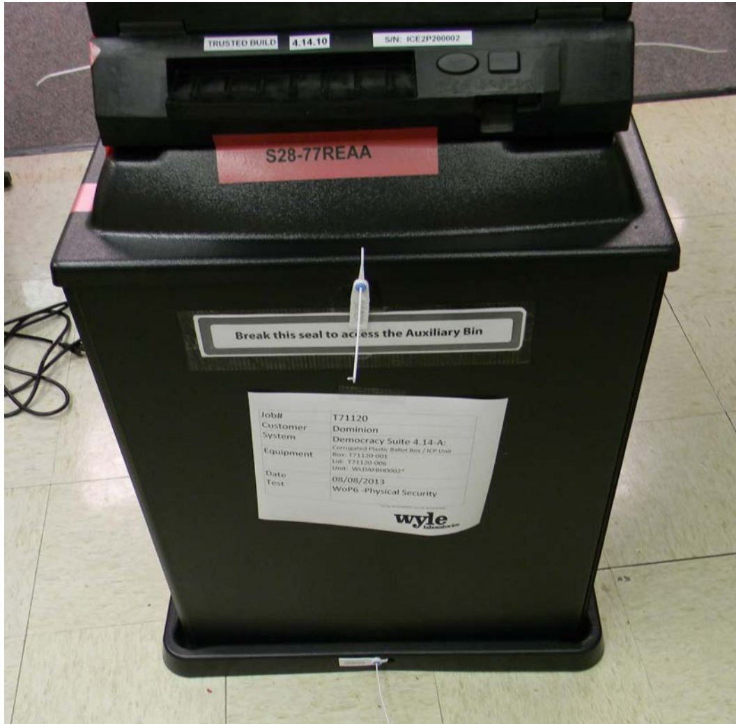
Photograph 4 ICE Security Test Setup