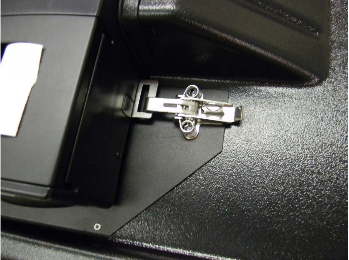
Photograph 10 ICP Coroplast Ballot Box – Locking Latch