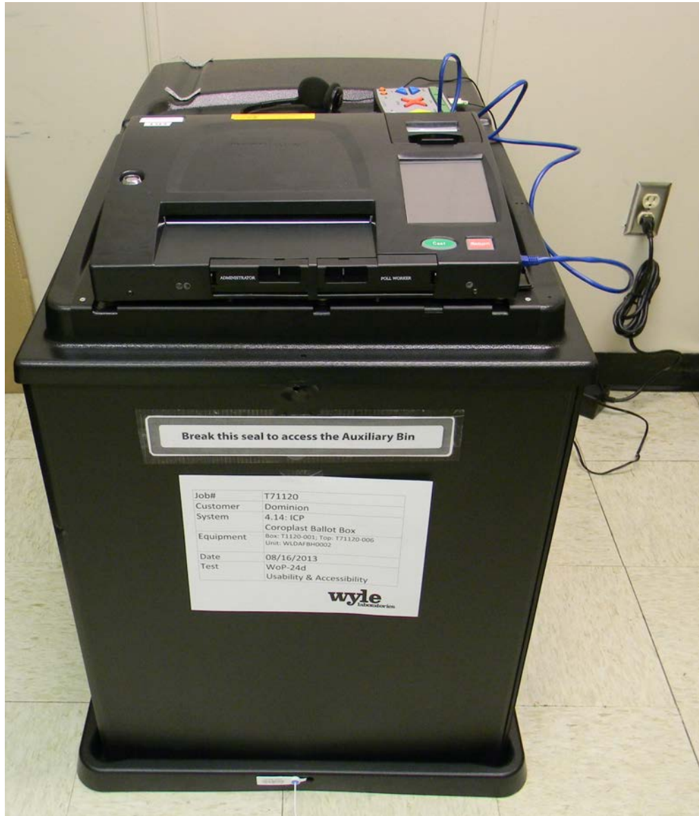
Photograph 12 ICP Coroplast Ballot Box – Usability Testing Setup