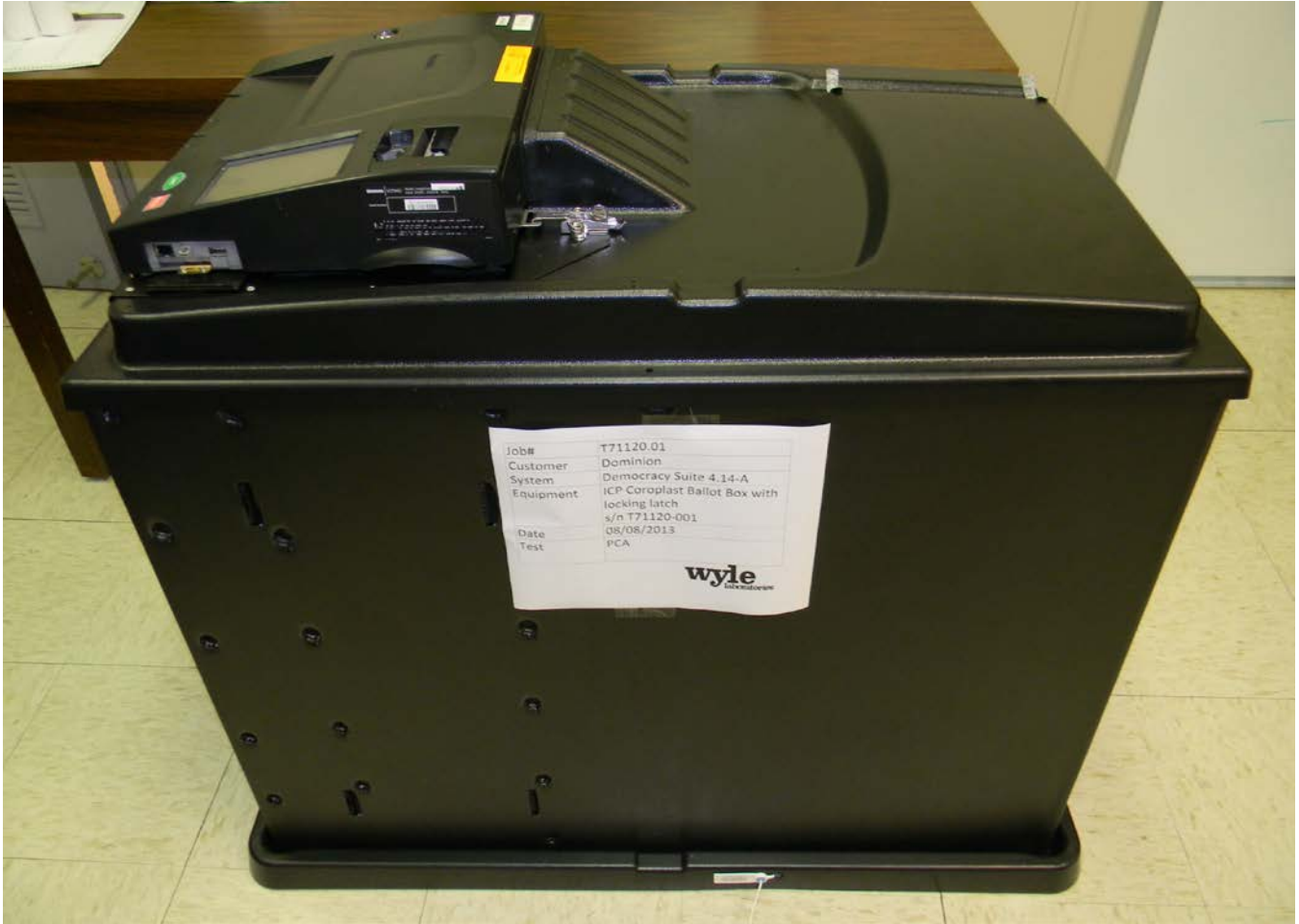
Photograph 2 ICP Coroplast Ballot Box with latch