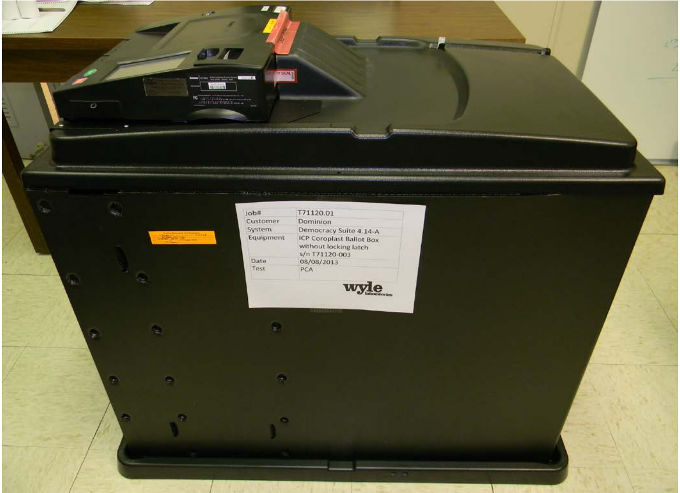
Photograph 3 ICP Coroplast Ballot Box without latch