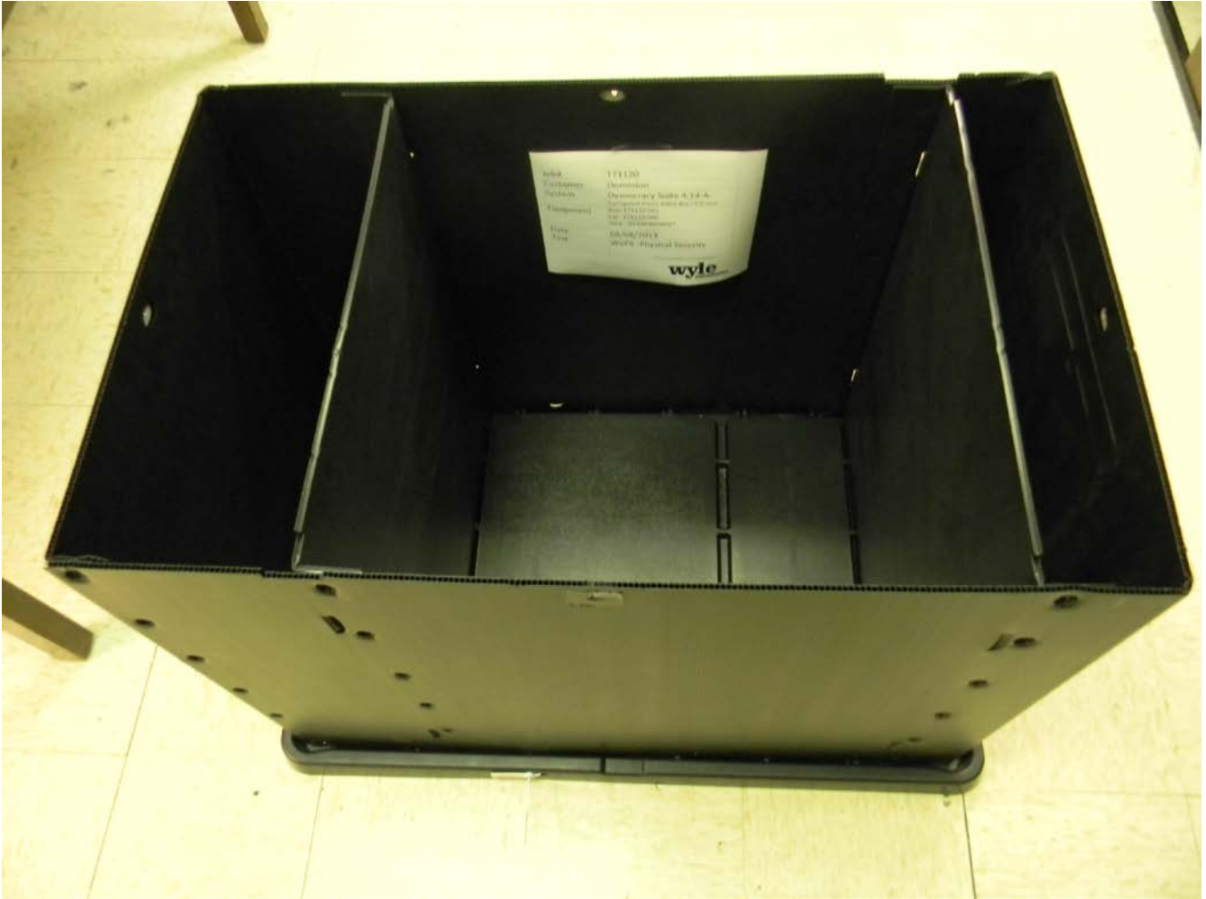
Photograph 8 ICE Coroplast Ballot Box – Internal Compartments