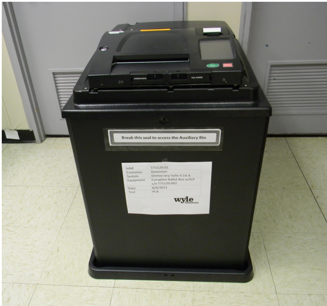
Photograph 2: ImageCast Precinct (ICP) on Coroplast Ballot Box

In addition, enhanced accessibility voting may be accomplished via optional accessories connected to the ImageCast unit. The ICP utilizes an ATI device to allow voters with disabilities to navigate and submit a voted ballot. This is accomplished by presenting the ballot to the voter in an audio format. The ATI is connected to the tabulator, and allows the voter to listen to an audio voting session consisting of contest and candidate names. The ATI also allows a voter to adjust the volume and speed of audio playback. The cast vote record is recorded electronically when the ATI is used to cast a ballot. There is no contemporaneous paper ballot or paper record produced when the ATI is utilized for voting. A ballot arising from the voter's choices may be printed from EMS at a later time.