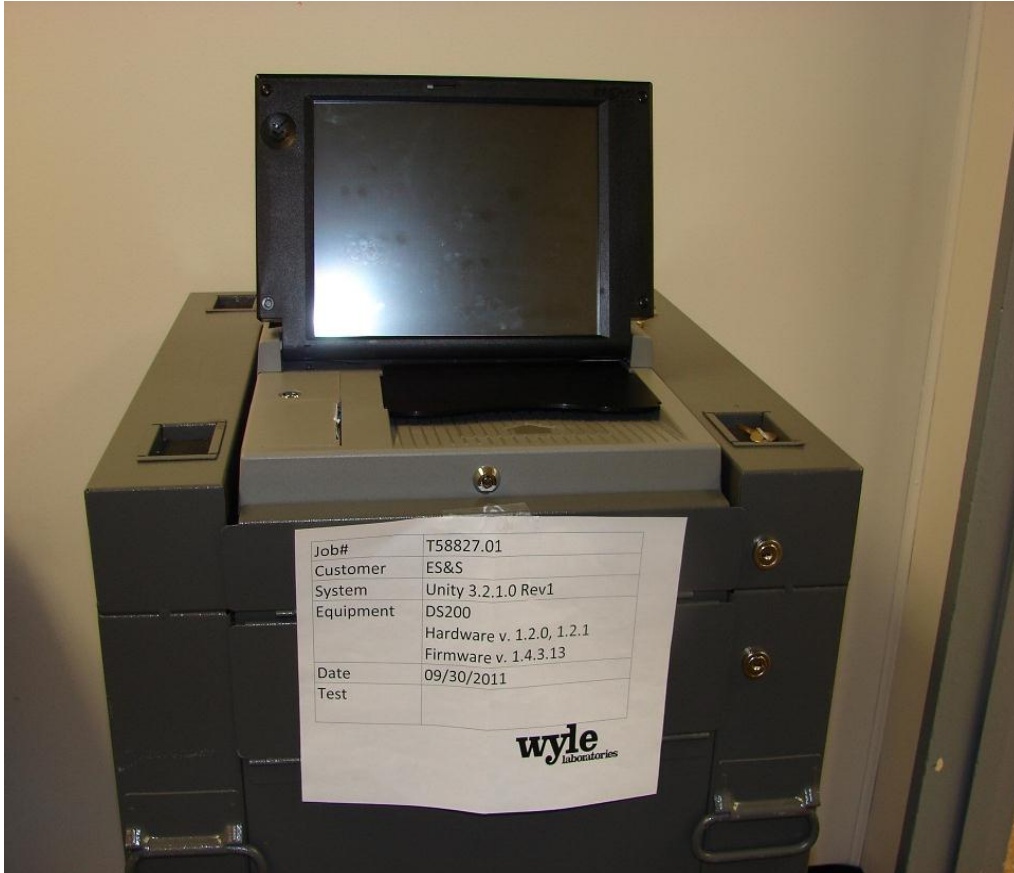
Photograph 3: DS200 (on metal ballot box)