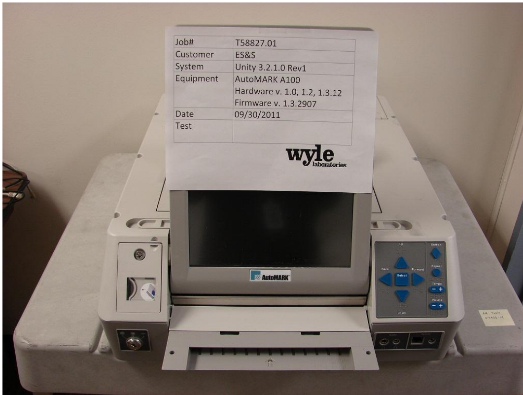
Photograph 7: AutoMARK A100 VAT