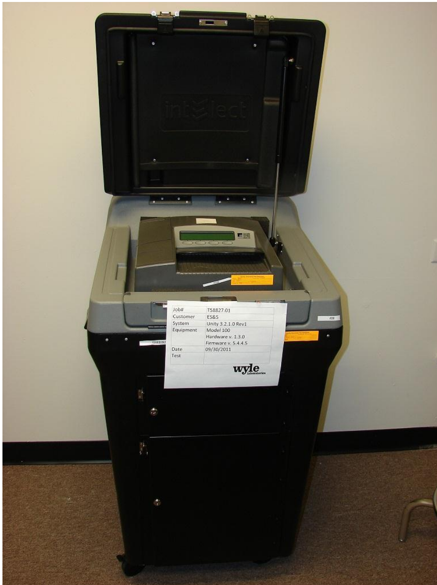
Photograph 1: M100 (on plastic ballot box)

The Model 100 is a precinct-based, voter-activated paper ballot tabulator that uses advanced Intelligent Mark Recognition (IMR) visible light scanning technology to detect completed ballot targets. The Model 100 is designed to alert voters to overvoted races, undervoted races, and blank ballots. It accepts ballots inserted in any orientation. Once the ballot is scanned by the Model 100, it is passed to the integrated ballot box.