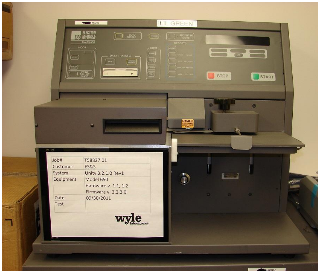
Photograph 5: M650

The Model 650 is a high-speed, optical scan central ballot counter. During scanning, the Model 650 prints a continuous audit log to a dedicated audit log printer and can print results directly from the scanner to a second connected printer. The scanner saves results to a Zip disk that officials can use to generate results reports from a PC running Election Reporting Manager. The Model 650 sorts write-in ballots, blank ballots, overvoted ballots and illegal ballots.