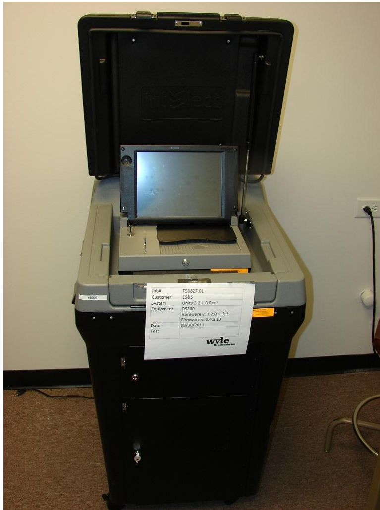
Photograph 2: DS200 (on plastic ballot box)

The system includes a 12-inch touch screen display providing clear voter feedback and poll worker messaging. Once a ballot is tabulated and the system updates internal vote counters, the ballot is dropped into an integrated ballot box. The DS200 includes an internal thermal printer for the printing of the printing of zero reports, log reports, and polling place totals upon the official closing of the polls.