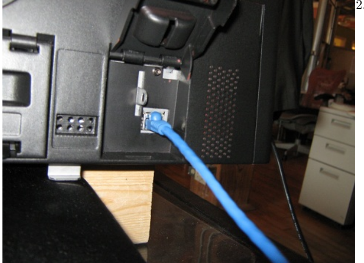
Figure 5.6: A.T.I. Device Plugged into the ICE.