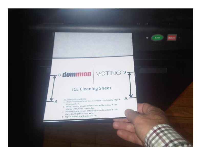
Figure 5.4: Feeding the ICE Cleaning Sheet Back and Forth

Step 6: Repeat steps 4 and 5 as required in a back and forth motion. Note that the leading edge of the cleaning sheet passes over the upper and lower scanners as the sheet is moved between the "A" and "B" marks.