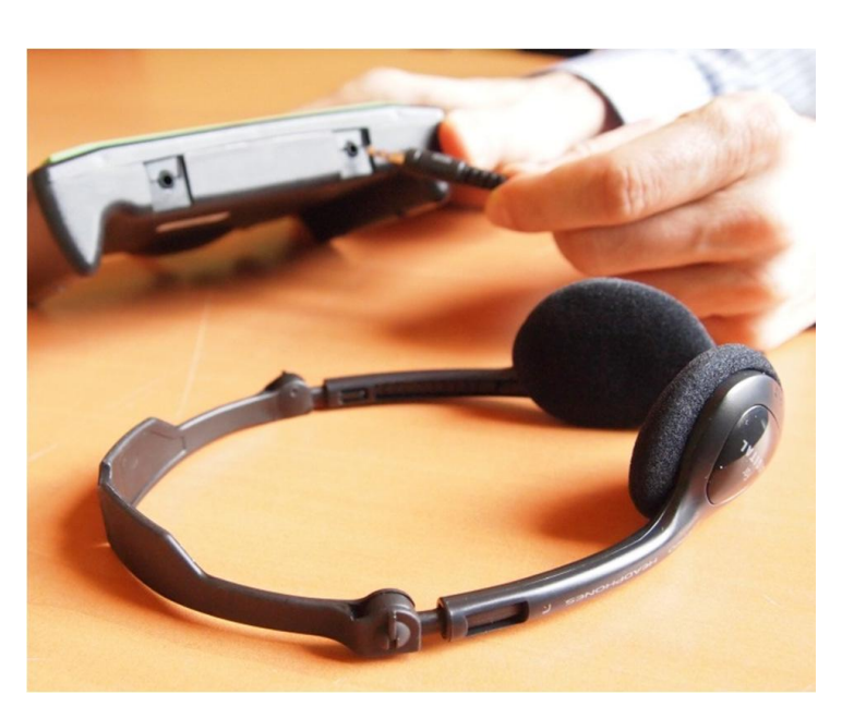
Figure 5.7: Connect the headphones to the headphone jack at the bottom of the ATI.

3. Connect the headphones to the headphone jack on the bottom right of the ATI.