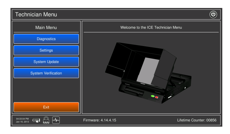
Figure 4.1: ImageCast<sup>®</sup> Evolution Technician Menu