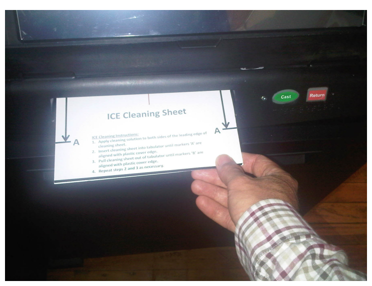
the cleaning sheet is aligned with the bottom surface of tabulator's entry slot cover. Step 5: Pull the cleaning sheet un-

Step 4: Continue to feed the sheet into the tabulator until the "A" line on