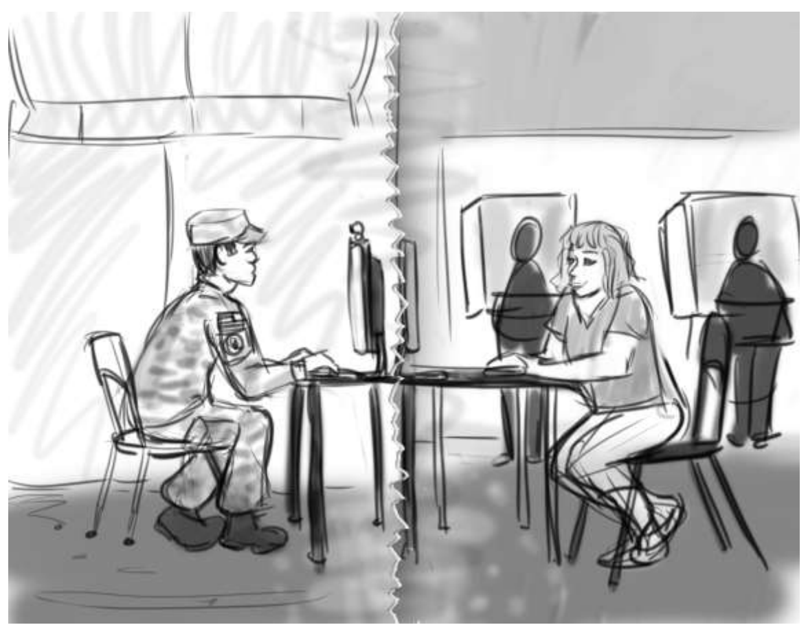
Figure 4: Soldier interacting with a remote election official to cast his ballot

Next, we have a soldier overseas that goes online and fills out his ballot. When the soldier is ready to cast his ballot, s/he will press a submit button and s/he will be placed into the queue for remote election officials. When the soldier's turn arrives, s/he will enter a live videoconference session with the remote election official, see Figure 4. The remote election official will verify the soldier's identity before printing the soldier's ballot. We are also adding a telephone line to the remote election official's desk so that s/he can actually use the phone line to also verify the soldier's identity and vice versa. Also, keep in mind that the remote election officials are located in the polling place; therefore, their identity is known by anyone that wants to poll watch.