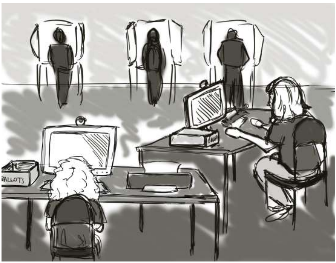
Figure 3: Polling place with remote election officials

Figure 3 is also an illustration of the polling place that captures the remote election officials. Notice that the remote election officials are seated with a monitor equipped with a webcam, a printer and a ballot box. We have made a recent recommendation to place the remote election officials against the walls if possible or maybe facing each other. Figure 3 does not include those recommendations. The remote election officials will service the overseas voters.