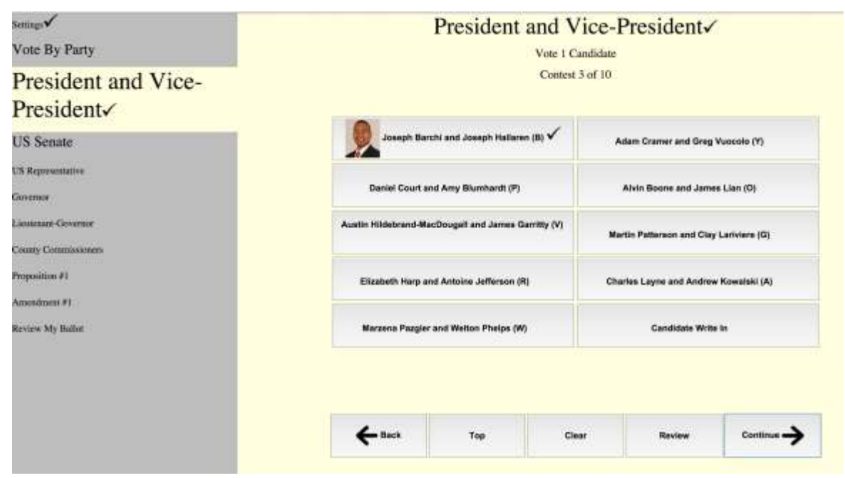
Figure 1: LEVI integrated into Prime III