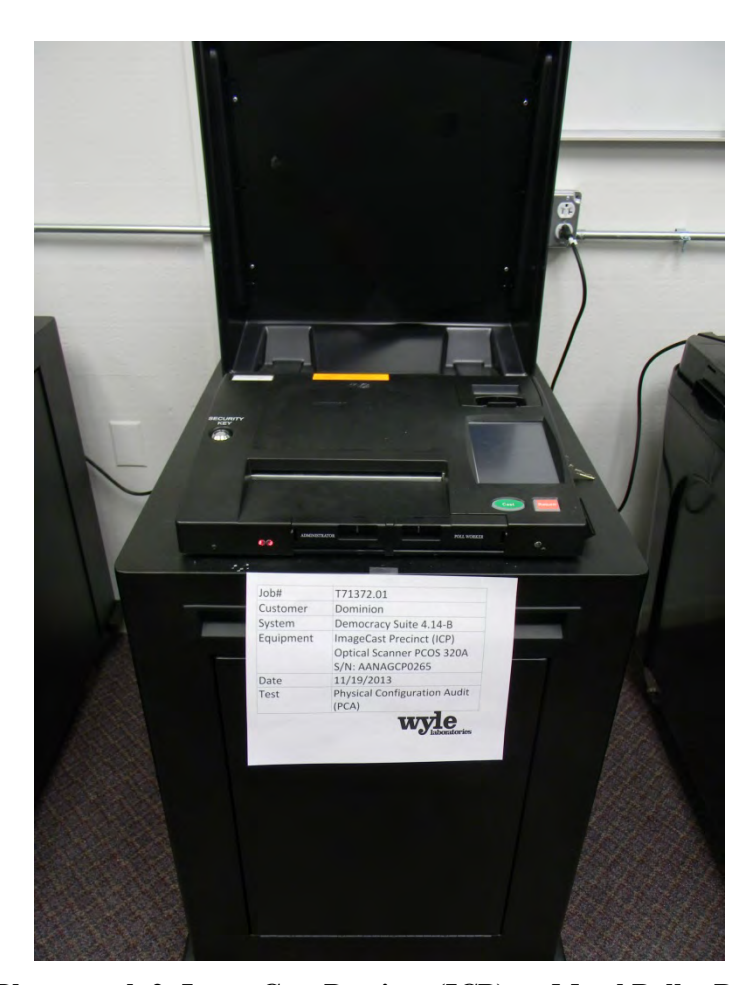
Photograph 2: ImageCast Precinct (ICP) on Metal Ballot Box

In addition, enhanced accessibility voting may be accomplished via optional accessories connected to the ImageCast unit. The ICP utilizes an ATI device to allow voters with disabilities to navigate and submit a voted ballot. This is accomplished by presenting the ballot to the voter in an audio format. The ATI is connected to the tabulator, and allows the voter to listen to an audio voting session consisting of contest and candidate names. The ATI also allows a voter to adjust the volume and speed of audio playback. The cast vote record is recorded electronically when the ATI is used to cast a ballot. There is no contemporaneous paper ballot or paper record produced when the ATI is utilized for voting. A ballot arising from the voter's choices may be printed from EMS at a later time.