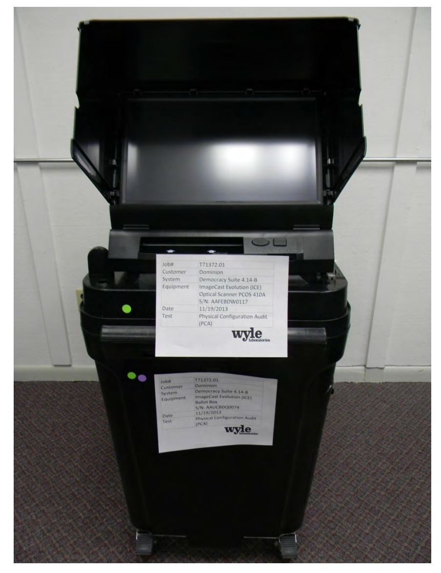
Photograph 1: ImageCast Evolution (ICE) on Plastic Ballot Box

Precinct Ballot Tabulator: ImageCast Evolution (ICE) (Continued)