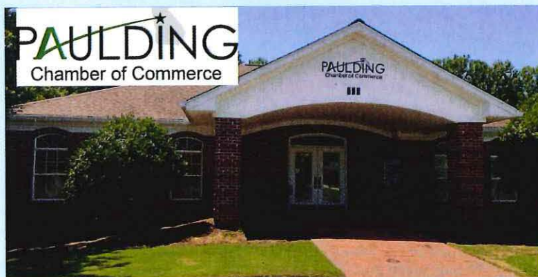
▲ PAULDING CHAMBER OF COMMERCE