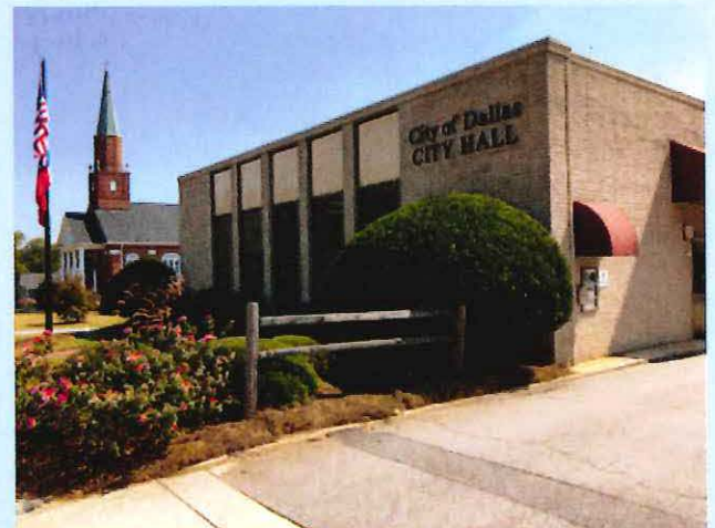
▲ CITY OF DALLAS CITY HALL