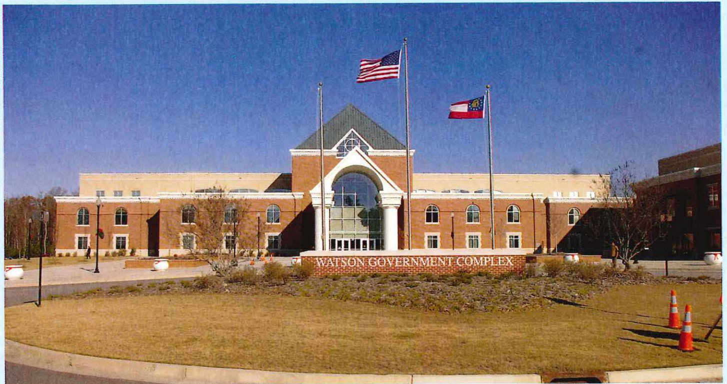
▲ WATSON GOVERNMENT COMPLEX