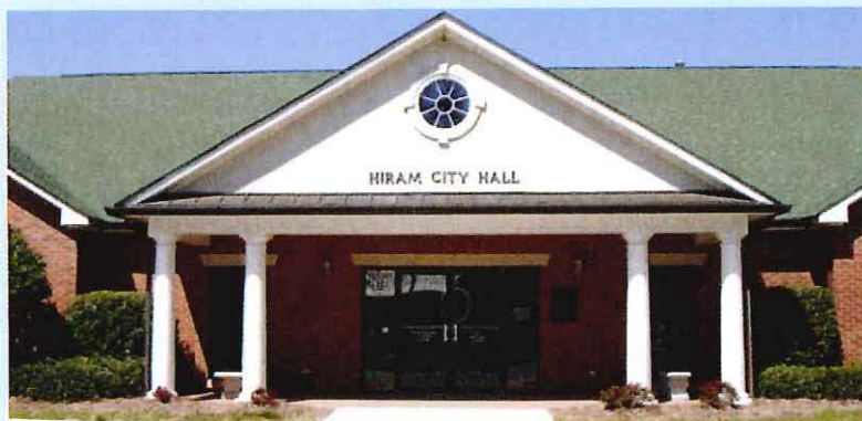
▲ HIRAM CITY HALL