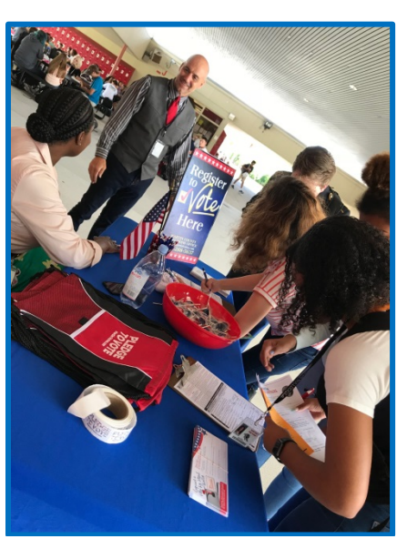
Voter Drive to recruit student election workers