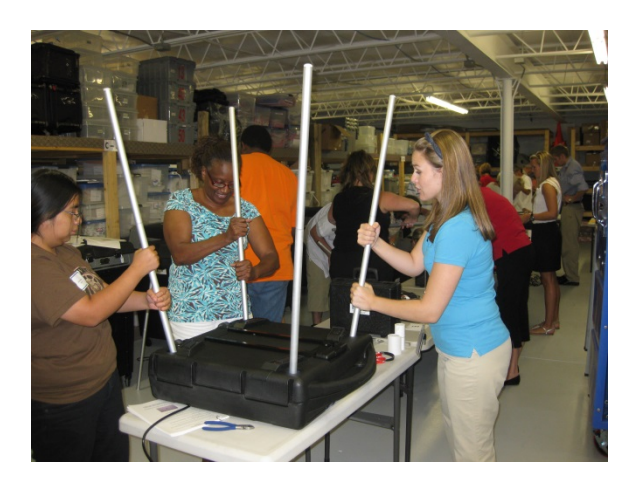
Students attending tech training