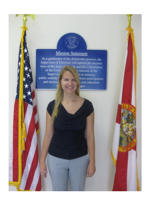
Student Intern/Election Worker