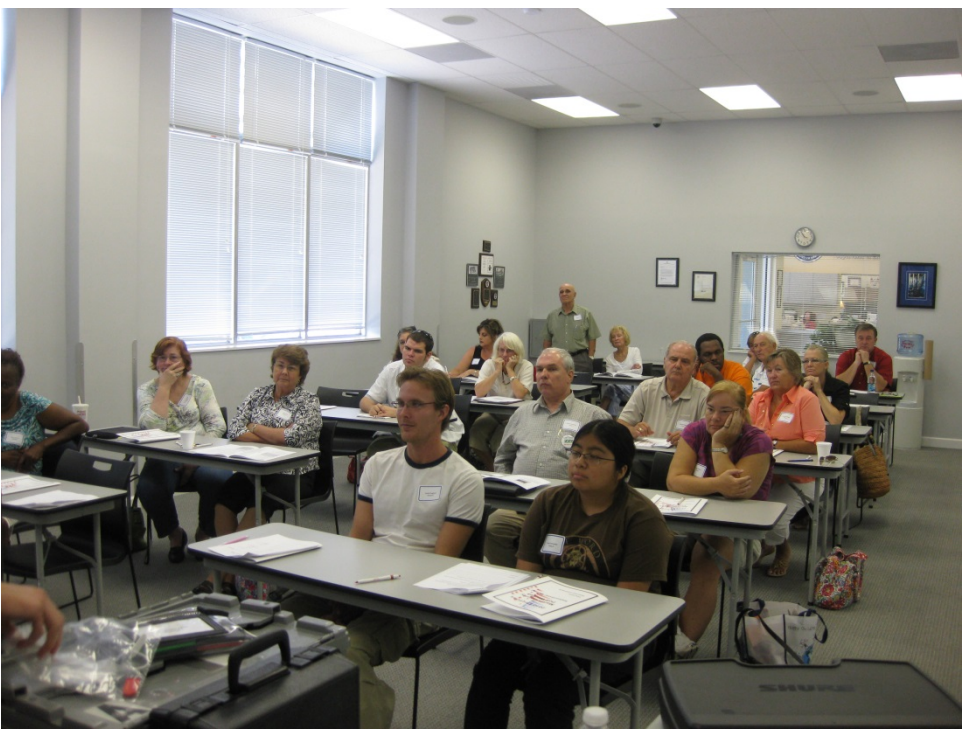
Election Worker Training-High School Students, College Students and Senior Workers