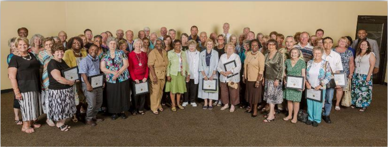
Some of the 78 election officials (accompanied by board members and staff) who were recognized for 10, 15 and 20 Elections served, on June 24, 2016, in New Hanover County.

Probably one of the most important efforts to be undertaken by the New Hanover County Board of Elections is the collective recognition of election officials for service longevity. In checking historical documentation, as far back as 2006, and through inquiries with veteran staff and precinct volunteers, the Elections Director determined that there had never been any formal awards program to recognize precinct workers for service in New Hanover County. We were surprised to learn that some election officials had worked as many as 20 consecutive elections over the past 10 years following final data compilation and validation.