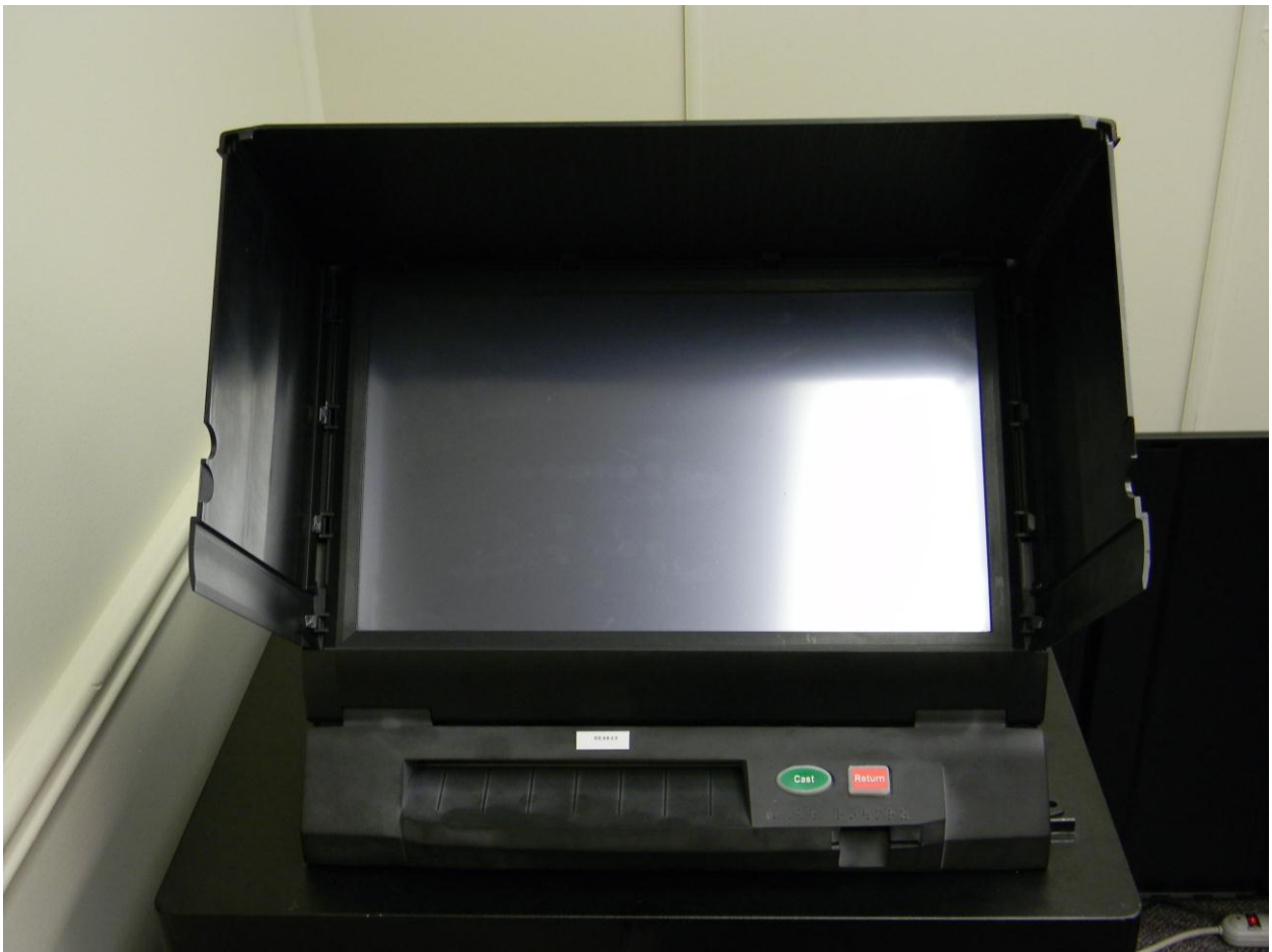
Photograph 1: ImageCast Evolution (ICE)

The Dominion Democracy Suite ImageCast Evolution system employs a precinct-level optical scan ballot counter (tabulator) in conjunction with an external ballot box. This tabulator is designed to mark and/or scan paper ballots, interpret voting marks, communicate these interpretations back to the voter (either visually through the integrated LCD display or audibly via integrated headphones), and upon the voter's acceptance, deposit the ballots into the ballot box. The unit also features an Audio Tactile Interface (ATI) which permits voters who cannot negotiate a paper ballot to generate a synchronously human and machine-readable ballot from elector-input vote selections. In this sense, the ImageCast Evolution acts as a ballot marking device.