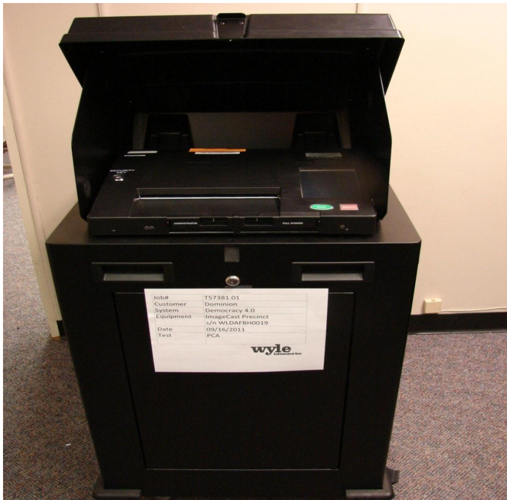
Photograph 2: ImageCast Precinct (ICP)

In addition, enhanced accessibility voting may be accomplished via optional accessories connected to the ImageCast unit. The ICP utilizes an ATI device to allow voters with disabilities to navigate and submit a voted ballot. This is accomplished by presenting the ballot to the voter in an audio format. The ATI is connected to the tabulator, and allows the voter to listen to an audio voting session consisting of contest and candidate names. The ATI also allows a voter to adjust the volume and speed of audio playback. The cast vote record is recorded electronically when the ATI is used to cast a ballot. There is no paper ballot or paper record produced when the ATI is utilized for voting.