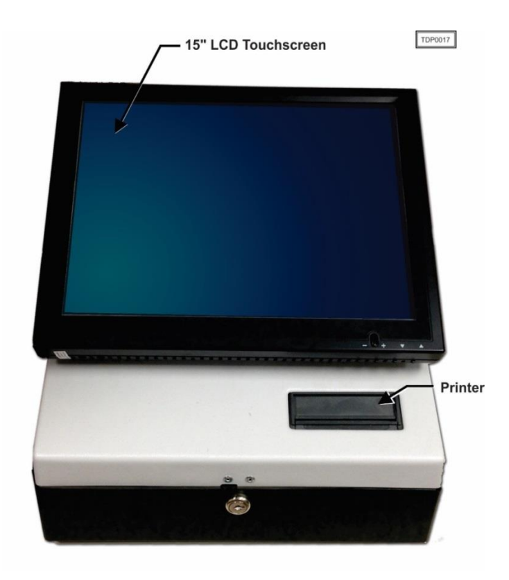
Figure 1-2. OVI