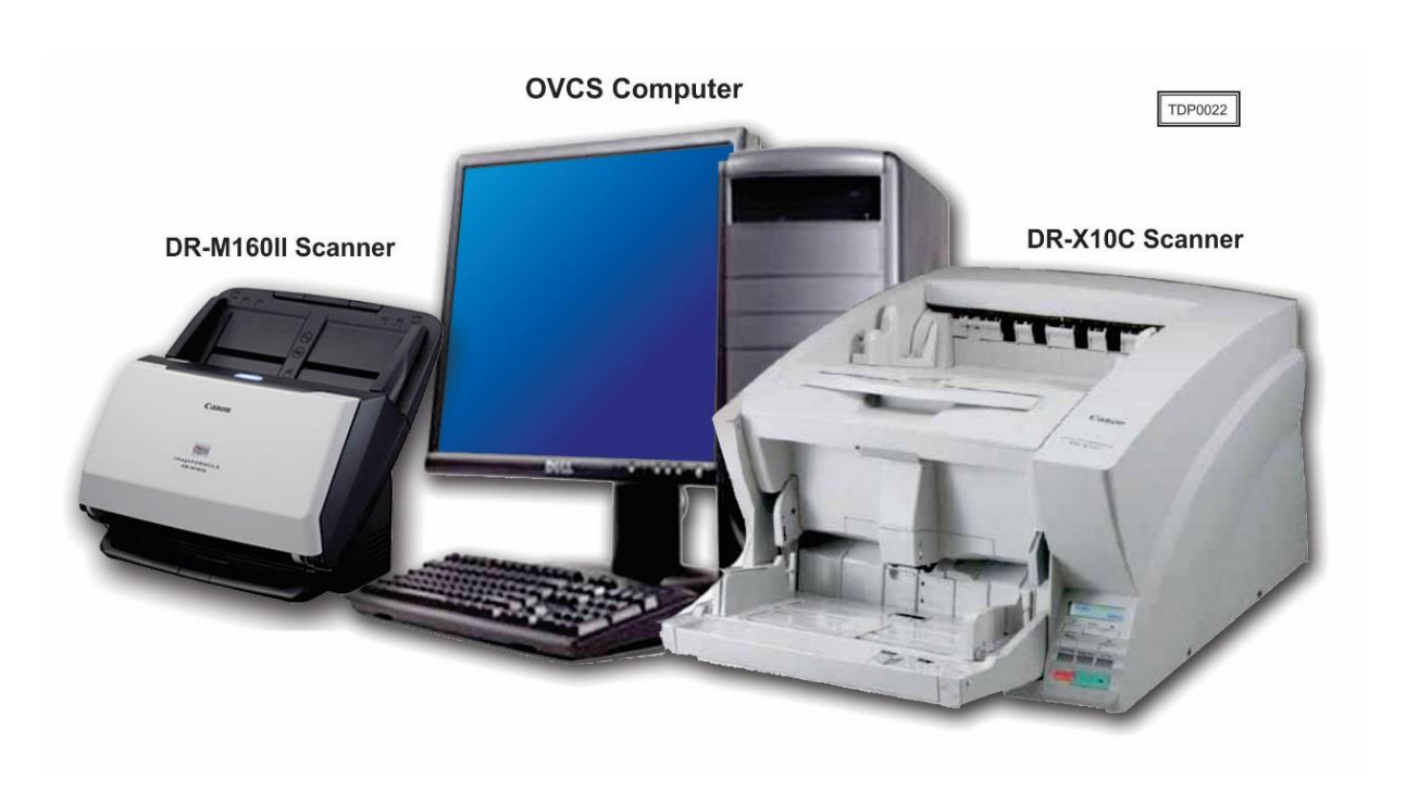
Figure 1-4. OVCS