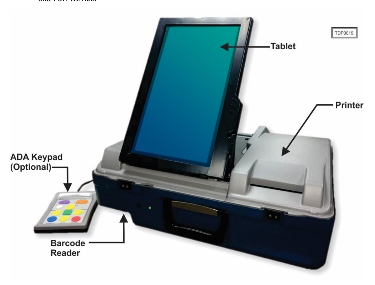
Figure 1-3 FVT