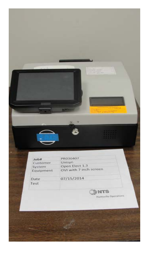
Figure 1-3 OVI with 7 Inch Screen

The OVI facilitates special needs voters through a variety of methods including wheelchair access, sip & puff, zoom-in ballot function, and audio assistance for the visually impaired. The OVI provides for write-in candidates when authorized by the jurisdiction. Voters input candidates' names via the ADA keypad, touchscreen or sip & puff device. Each OVI can support multiple languages for both visual and audio ballots, allowing the voter to choose their preferred language.