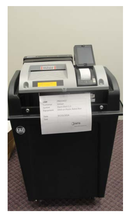
Figure 1-1 OVO on Plastic Ballot Box

The Unisyn OpenElect Voting Optical (OVO) is a full-page, dual-sided optical scan ballot system which scans and validates voter ballots and provides a summary of all ballots cast. The election is loaded from the OVS Election Server over a secure local network or via a USB thumb drive. On Election Day, an OVO at each polling location scans and validates voters' ballots, and provides precinct tabulation and reporting. The OVO unit is also paired with the OVI for early voting to scan and tabulate early voting ballots. OVO units can also be used at election headquarters to read absentee, provisional, or recount ballots in smaller jurisdictions.