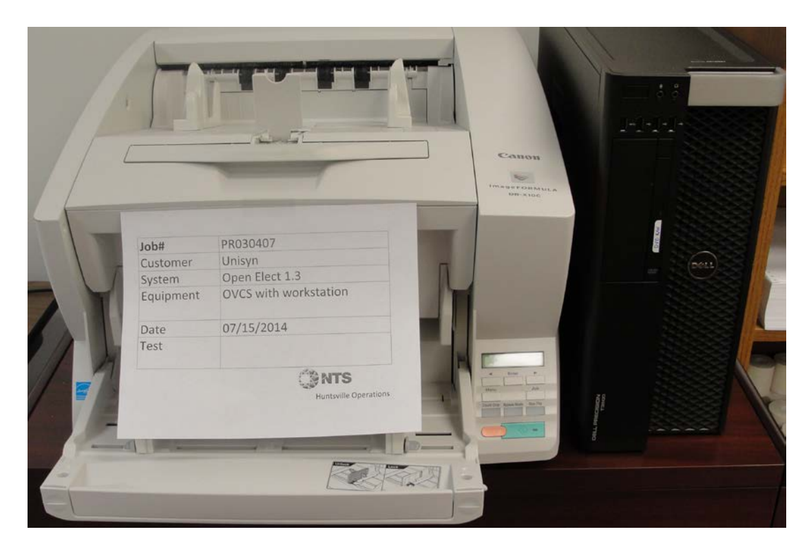
Figure 1-5 Canon DR-X10C Scanner and OVCS Workstation