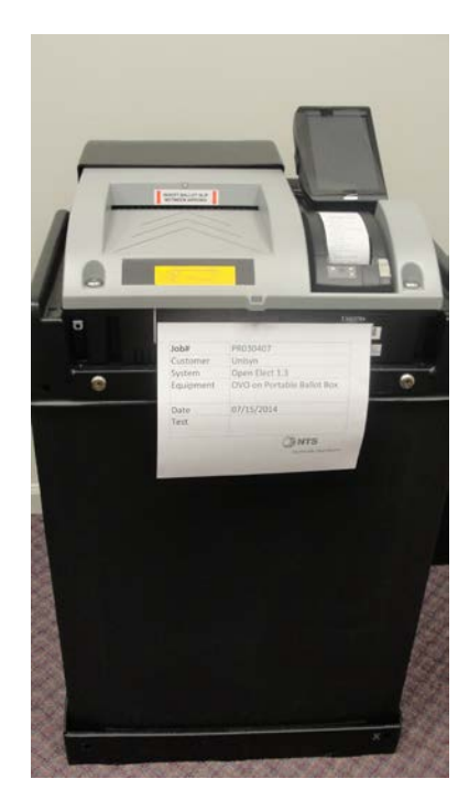
Figure 1-2 OVO on Portable Ballot Box