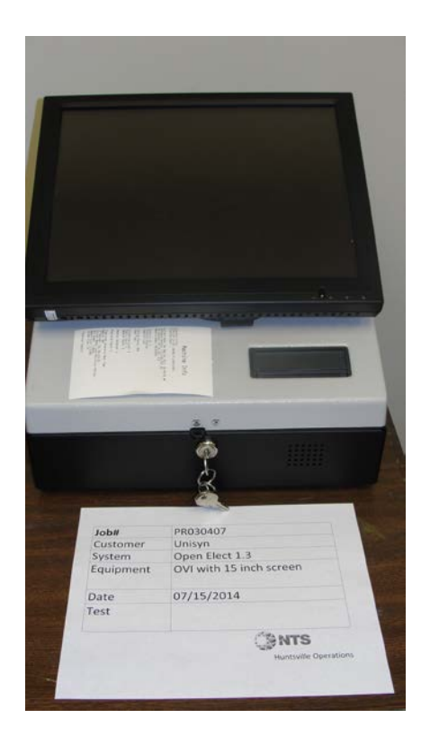
Figure 1-4 OVI with 15 Inch Screen