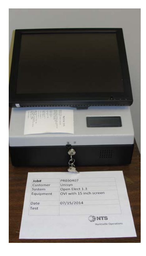
Figure 1-4 OVI with 15 Inch Screen