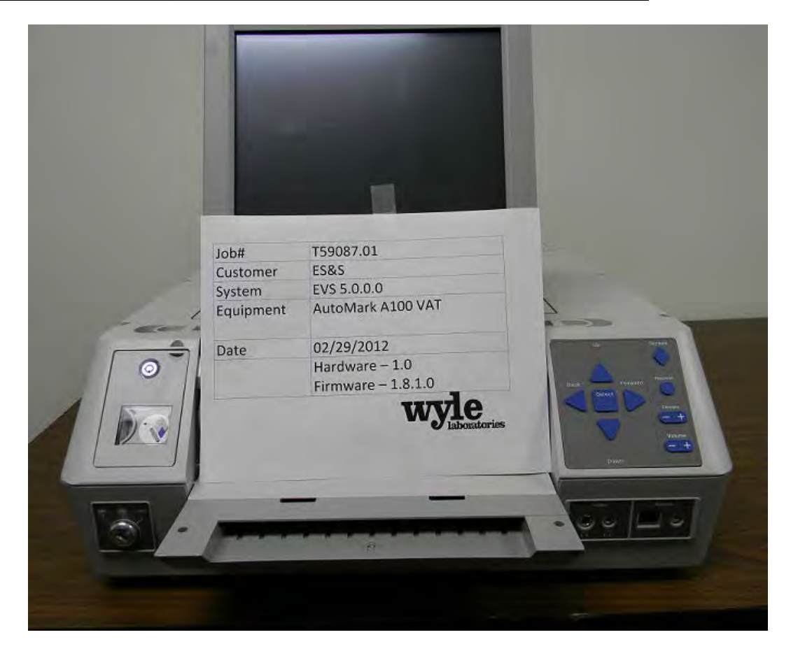
Photograph No. 4: AutoMARK<sup>TM</sup> A100 VAT

Electronic Ballot Marking Device: AutoMARK<sup>TM</sup> Voter Assist Terminal (VAT) (Continued)