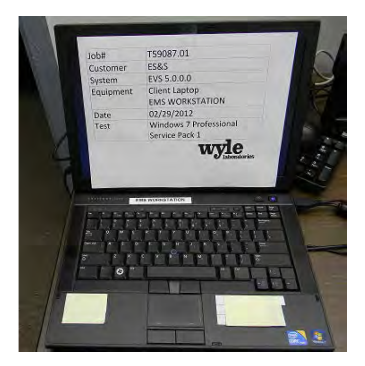
Photograph No. 7: EMS Client Laptop

<u>EMS Client Server Configuration</u> (Continued)