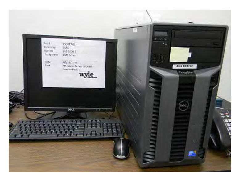
Photograph No. 6: EMS Server

EVS 5.0.0.0 Voting System Election Management System (EMS) will be configured with a Server running Windows Server 2008 R2 and a combination of a client laptop and a client desktop running Windows 7 Professional.