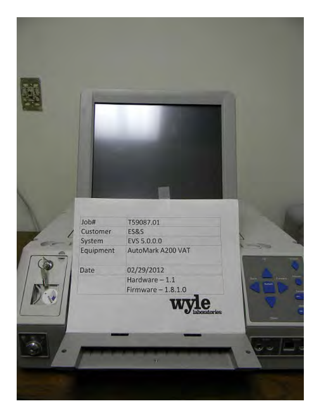
Photograph No. 3: AutoMARK<sup>TM</sup> A200 VAT

The A100, A200 and A300 all operate the same and have the same features. The difference between the models is the location of two printed circuit boards and related wiring harness and cables. In the A200, the Printer Engine Board and Power Supply Board were moved from under the machine to the top. The A300 has a different lock and label. Since this change is so minor, the A300 equipment will not be tested. However, the A300 will be included in the recommendation for certification.