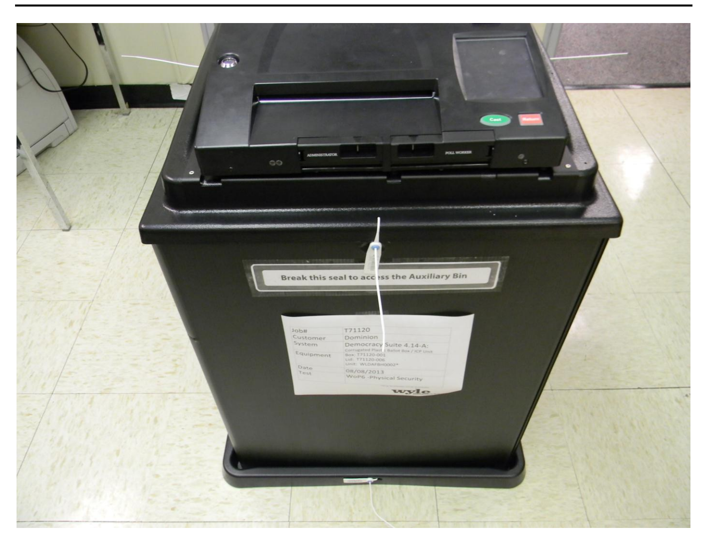
Photograph 5 ICP Security Test Setup