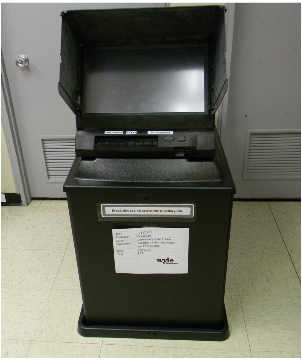
Photograph 1: ImageCast Evolution (ICE) on Coroplast Ballot Box

The Dominion Democracy Suite ImageCast Evolution system employs a precinct-level optical scan ballot counter (tabulator) in conjunction with an external plastic ballot box. This tabulator is designed to mark and/or scan paper ballots, interpret voting marks, communicate these interpretations back to the voter (either visually through the integrated LCD display or audibly via integrated headphones), and upon the voter's acceptance, deposit the ballots into the ballot box. The unit also features an Audio Tactile Interface (ATI) which permits voters who cannot negotiate a paper ballot to generate a synchronously human and machine-readable ballot from elector-input vote selections. In this sense, the ImageCast Evolution acts as a ballot marking device.