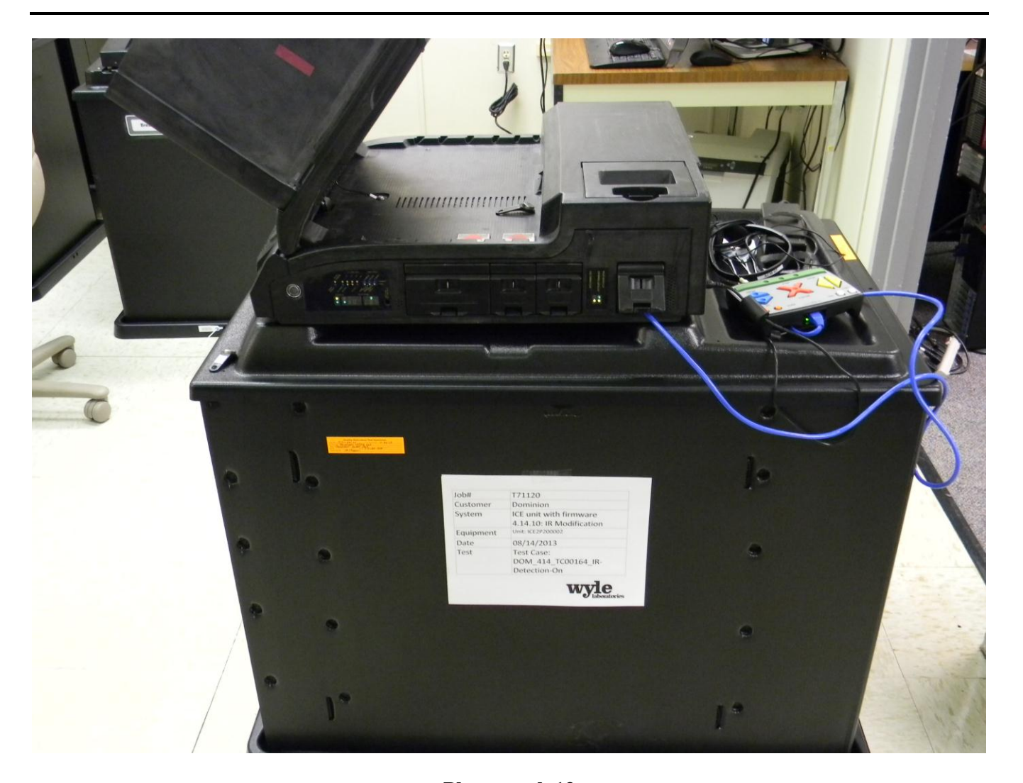
Photograph 13 ICE Functional Test Setup – IR Paper Detection