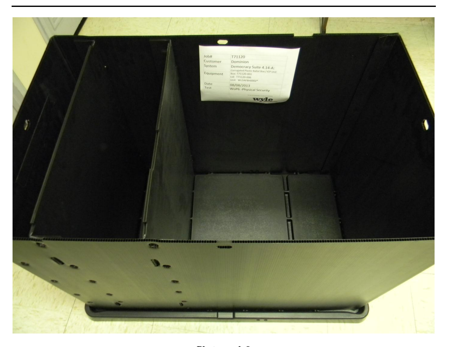
Photograph 9 ICP Coroplast Ballot Box – Internal Compartments