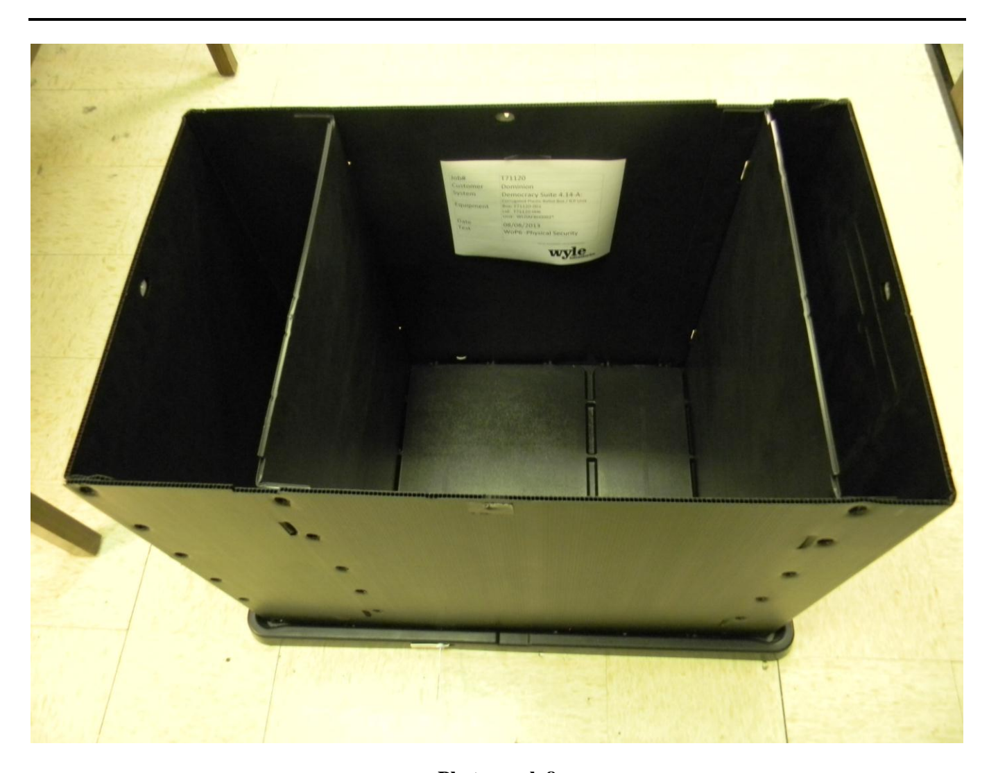
Photograph 8 ICE Coroplast Ballot Box – Internal Compartments