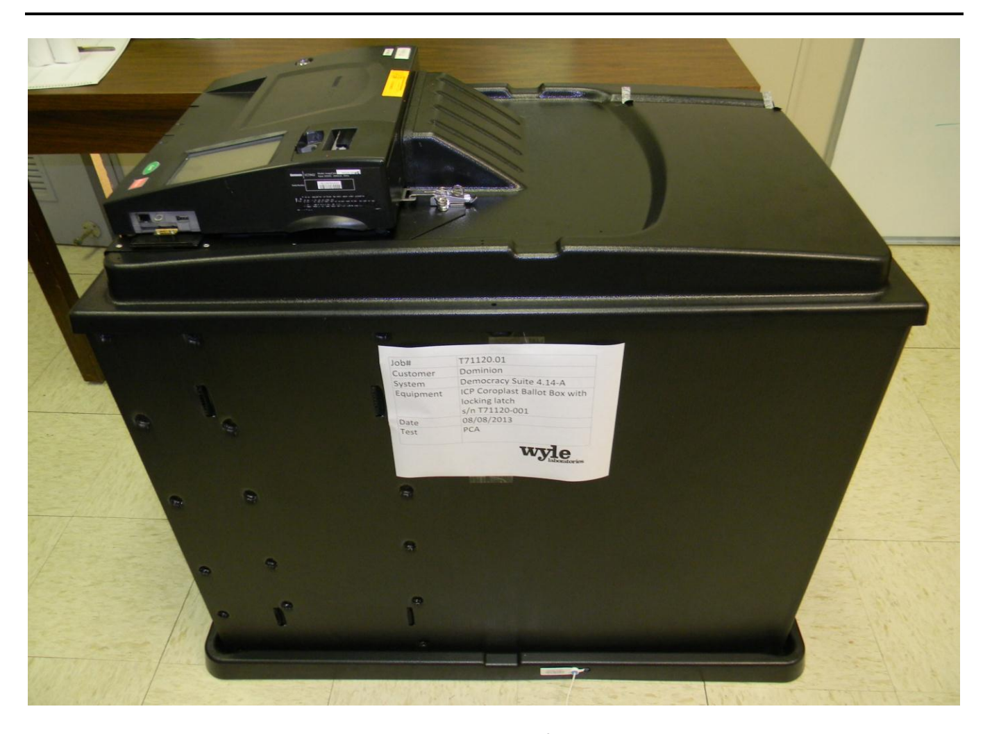
Photograph 2 ICP Coroplast Ballot Box with latch