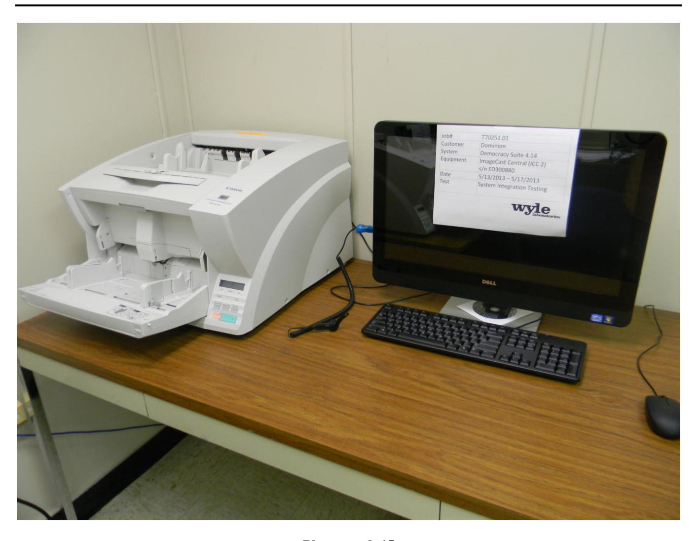
Photograph 15 ICC Functional Test Setup – IR Paper Detection