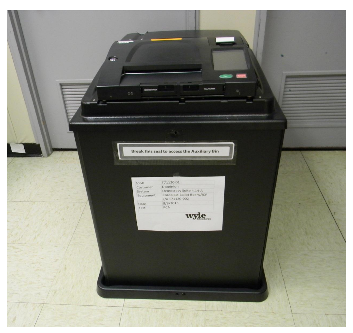
Photograph 2: ImageCast Precinct (ICP) on Coroplast Ballot Box

In addition, enhanced accessibility voting may be accomplished via optional accessories connected to the ImageCast unit. The ICP utilizes an ATI device to allow voters with disabilities to navigate and submit a voted ballot. This is accomplished by presenting the ballot to the voter in an audio format. The ATI is connected to the tabulator, and allows the voter to listen to an audio voting session consisting of contest and candidate names. The ATI also allows a voter to adjust the volume and speed of audio playback. The cast vote record is recorded electronically when the ATI is used to cast a ballot. There is no contemporaneous paper ballot or paper record produced when the ATI is utilized for voting. A ballot arising from the voter's choices may be printed from EMS at a later time.