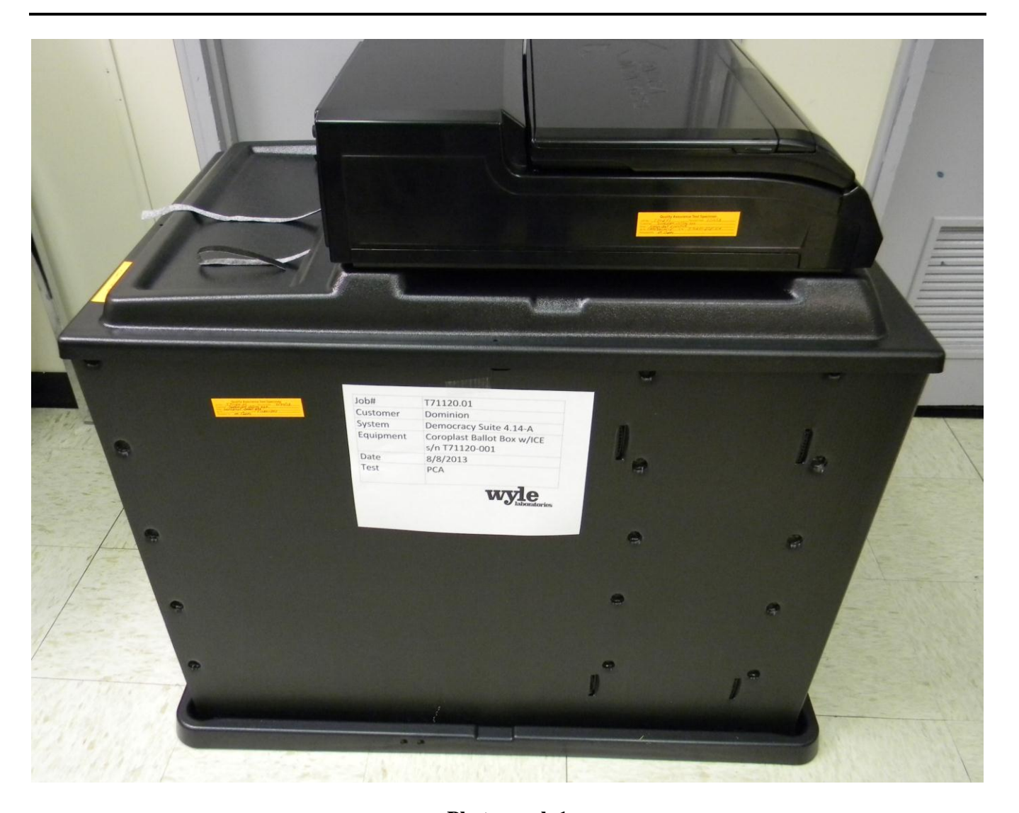
Photograph 1 ICE Coroplast Ballot Box