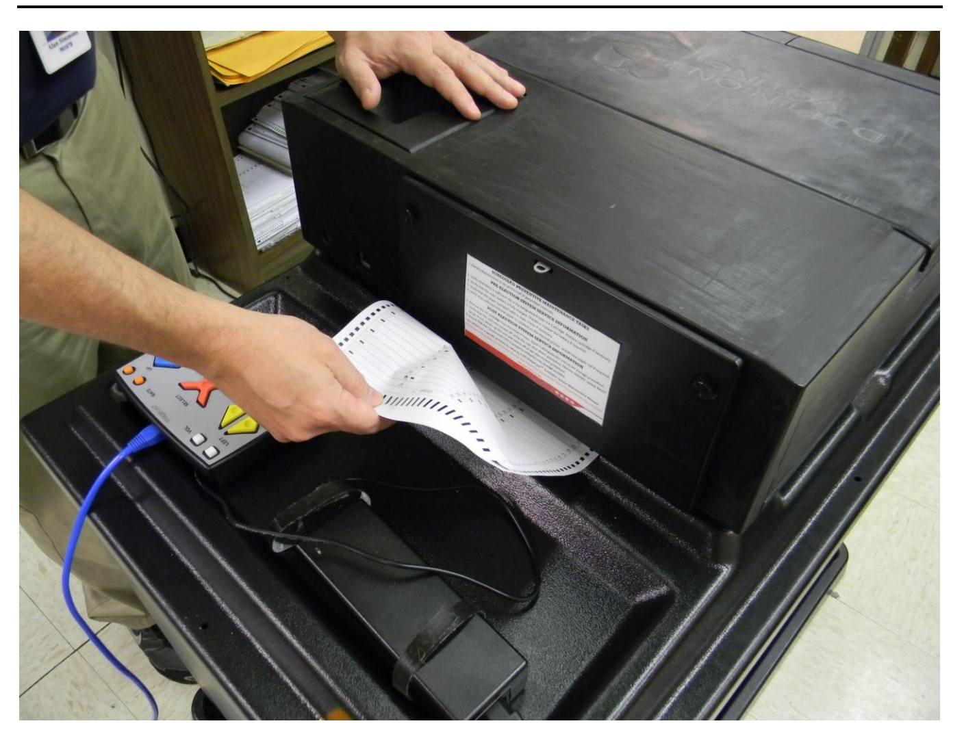
Photograph 6 ICE Ballot Box Security Testing – Attempting a security breach