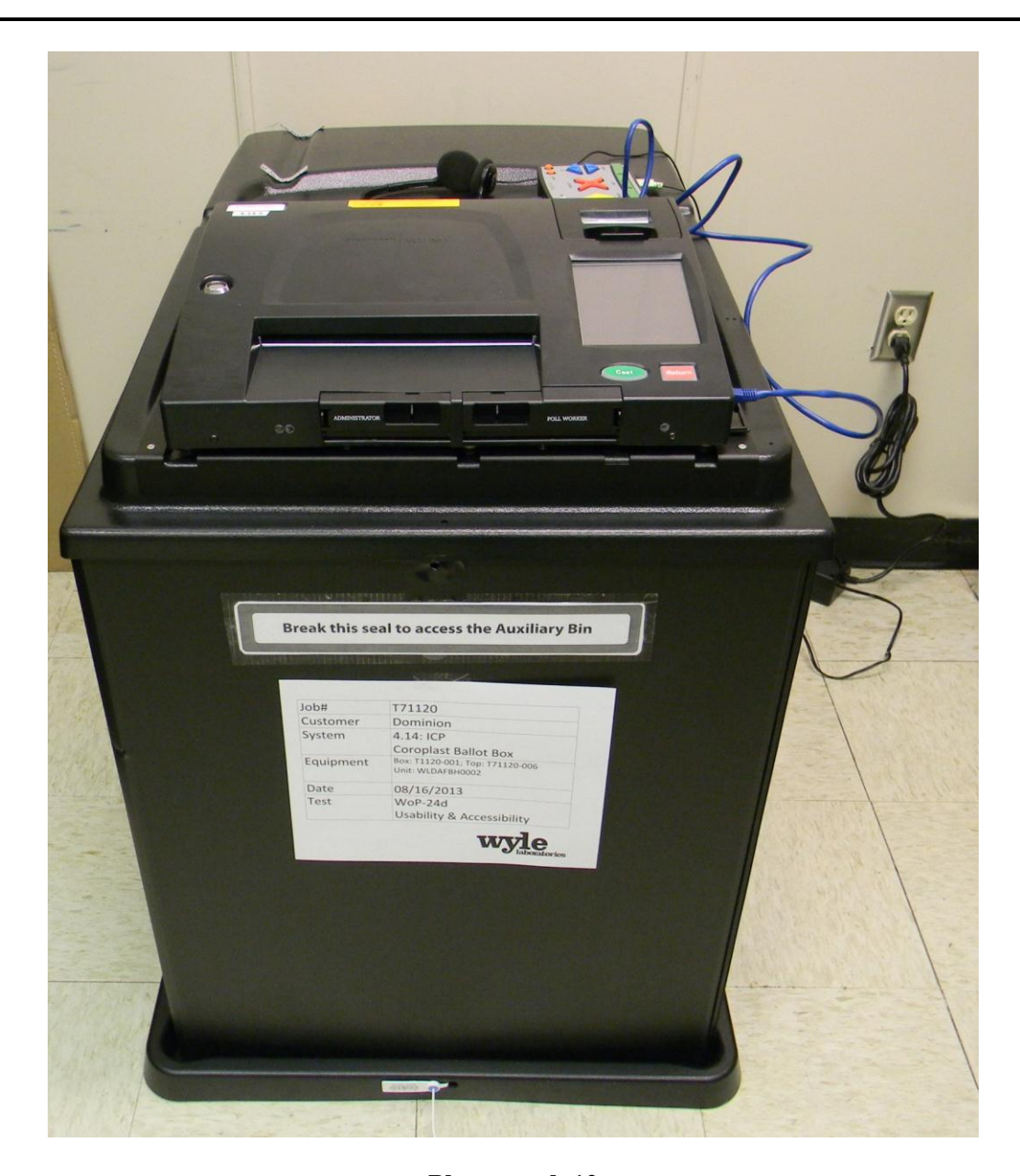
Photograph 12 ICP Coroplast Ballot Box – Usability Testing Setup