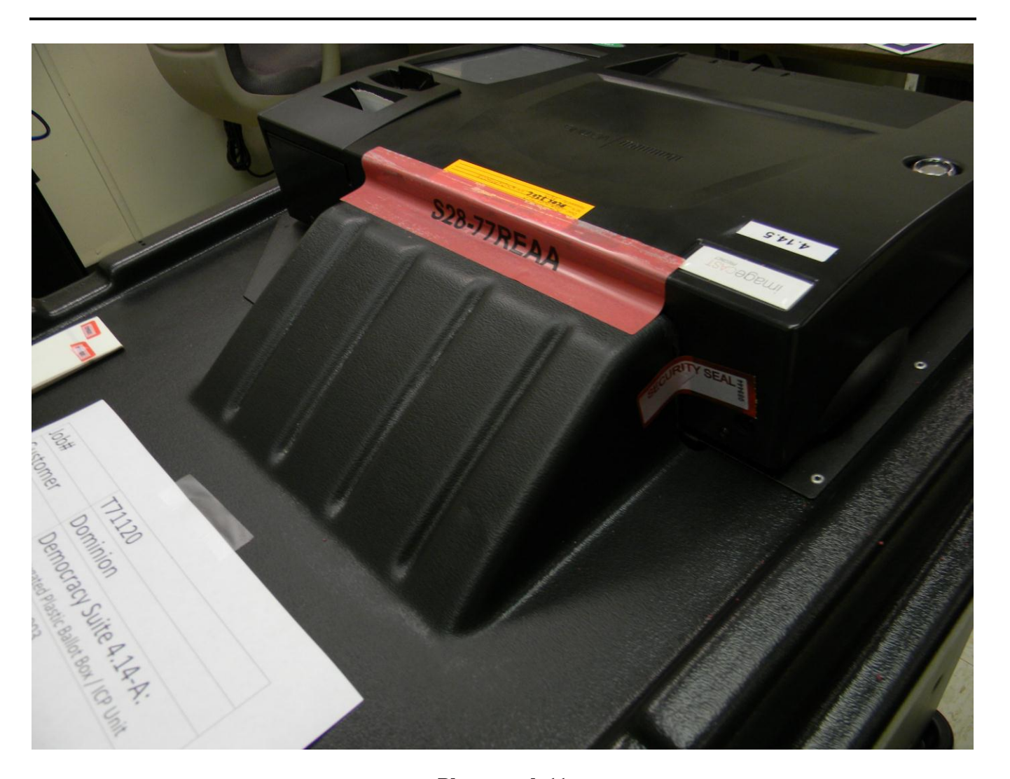
Photograph 11 ICP Coroplast Ballot Box without locking latch – Security Seals