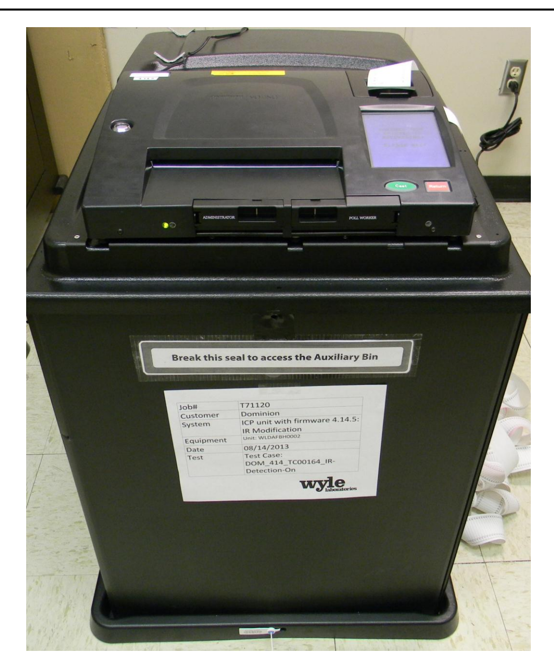
Photograph 14 ICP Functional Test Setup – IR Paper Detection