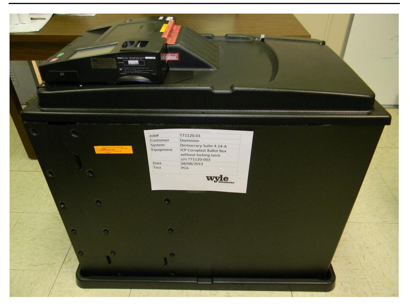
Photograph 3 ICP Coroplast Ballot Box without latch