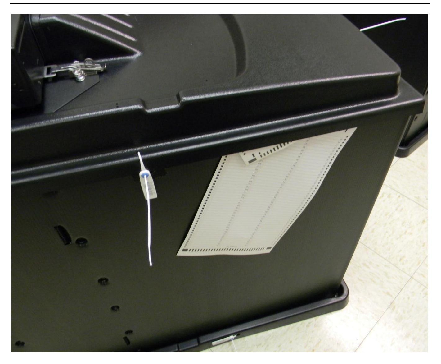
Photograph 7 ICP Ballot Box Security Testing – Attempting a security breach