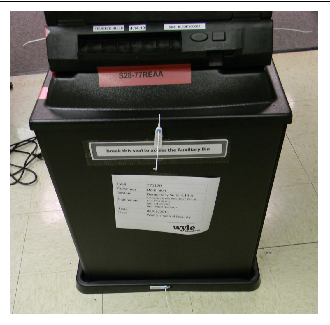
Photograph 4 ICE Security Test Setup