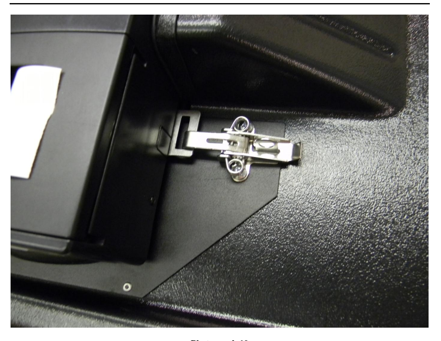
Photograph 10 ICP Coroplast Ballot Box – Locking Latch