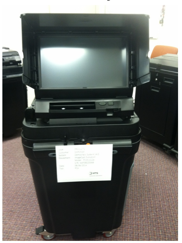
Figure 1-1: ImageCast Evolution (ICE) on Plastic Ballot Box

The Dominion Democracy Suite ImageCast Evolution System employs a precinct-level optical scan ballot counter (tabulator) in conjunction with ImageCast compatible ballot storage boxes. This tabulator is designed to mark and/or scan paper ballots, interpret voting marks, communicate these interpretations back to the voter (either visually through the integrated LCD display or optionally an external LCD display, or audibly via integrated headphones), and upon the voter's acceptance, deposit the ballots into the ballot box. The unit also features an Audio Tactile Interface (ATI) which permits voters who cannot negotiate a paper ballot to generate a synchronously human and machine-readable ballot from elector-input vote selections. In this sense, the ImageCast Evolution acts as a ballot marking device.