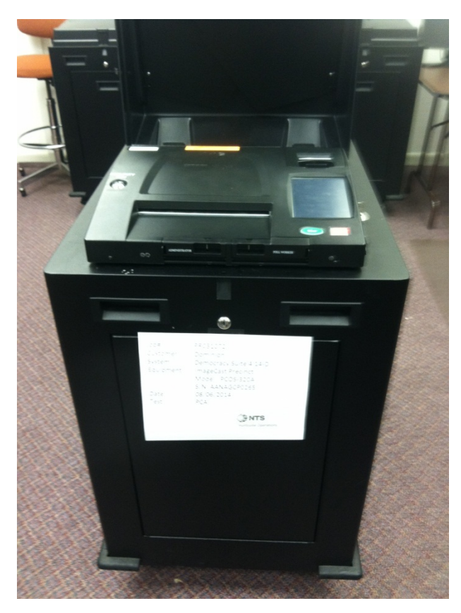
Figure 1-2: ImageCast Precinct (ICP) on Metal Ballot Box

In addition, enhanced accessibility voting may be accomplished via optional accessories connected to the ImageCast unit. The ICP utilizes an ATI device to allow voters with disabilities to navigate and submit a voted ballot. This is accomplished by presenting the ballot to the voter in an audio format. The ATI is connected to the tabulator and allows the voter to listen to an audio voting session consisting of contest and candidate names. The ATI also allows a voter to adjust the volume and speed of audio playback. The cast vote record is recorded electronically when the ATI is used to cast a ballot. There is no contemporaneous paper ballot or paper record produced when the ATI is utilized for voting. A ballot arising from the voter's choices may be printed from the EMS at a later time.