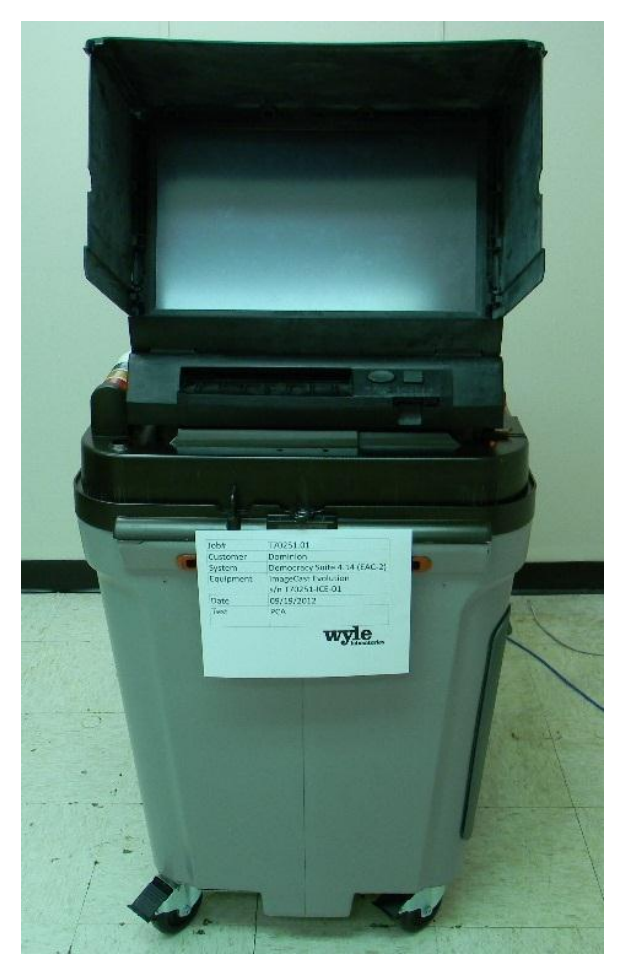
Photograph 1: ImageCast Evolution (ICE)

The Dominion Democracy Suite ImageCast Evolution system employs a precinct-level optical scan ballot counter (tabulator) in conjunction with an external plastic ballot box. This tabulator is designed to mark and/or scan paper ballots, interpret voting marks, communicate these interpretations back to the voter (either visually through the integrated LCD display or audibly via integrated headphones), and upon the voter's acceptance, deposit the ballots into the ballot box. The unit also features an Audio Tactile Interface (ATI) which permits voters who cannot negotiate a paper ballot to generate a synchronously human and machine-readable ballot from elector-input vote selections. In this sense, the ImageCast Evolution acts as a ballot marking device.