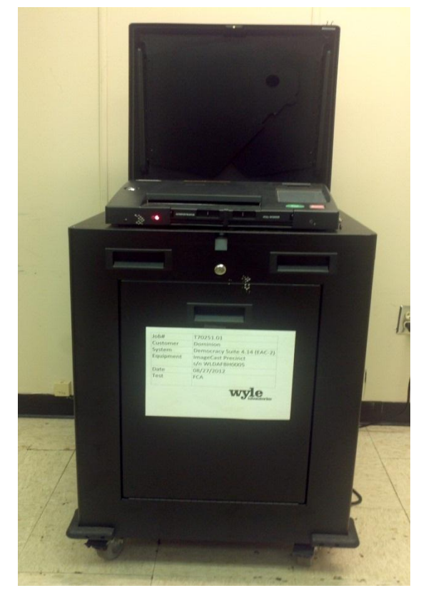
Photograph 2: ImageCast Precinct (ICP)

In addition, enhanced accessibility voting may be accomplished via optional accessories connected to the ImageCast unit. The ICP utilizes an ATI device to allow voters with disabilities to navigate and submit a voted ballot. This is accomplished by presenting the ballot to the voter in an audio format. The ATI is connected to the tabulator, and allows the voter to listen to an audio voting session consisting of contest and candidate names. The ATI also allows a voter to adjust the volume and speed of audio playback. The cast vote record is recorded electronically when the ATI is used to cast a ballot. There is no contemporaneous paper ballot or paper record produced when the ATI is utilized for voting. A ballot arising from the voter's choices may be printed from EMS at a later time.