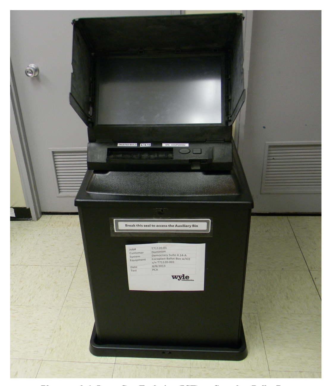
Photograph 1: ImageCast Evolution (ICE) on Coroplast Ballot Box

The Dominion Democracy Suite ImageCast Evolution system employs a precinct-level optical scan ballot counter (tabulator) in conjunction with an external plastic ballot box. This tabulator is designed to mark and/or scan paper ballots, interpret voting marks, communicate these interpretations back to the voter (either visually through the integrated LCD display or audibly via integrated headphones), and upon the voter's acceptance, deposit the ballots into the ballot box. The unit also features an Audio Tactile Interface (ATI) which permits voters who cannot negotiate a paper ballot to generate a synchronously human and machine-readable ballot from elector-input vote selections. In this sense, the ImageCast Evolution acts as a ballot marking device.