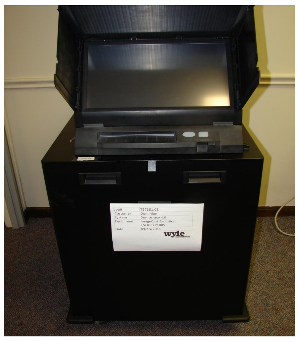
Photograph 1: ImageCast Evolution (ICE)

The Dominion Democracy Suite ImageCast Evolution system employs a precinct-level optical scan ballot counter (tabulator) in conjunction with an external ballot box. This tabulator is designed to mark and/or scan paper ballots, interpret voting marks, communicate these interpretations back to the voter (either visually through the integrated LCD display or audibly via integrated headphones), and upon the voter's acceptance, deposit the ballots into the ballot box. The unit also features an Audio Tactile Interface (ATI) which permits voters who cannot negotiate a paper ballot to generate a synchronously human and machine-readable ballot from elector-input vote selections. In this sense, the ImageCast Evolution acts as a ballot marking device.