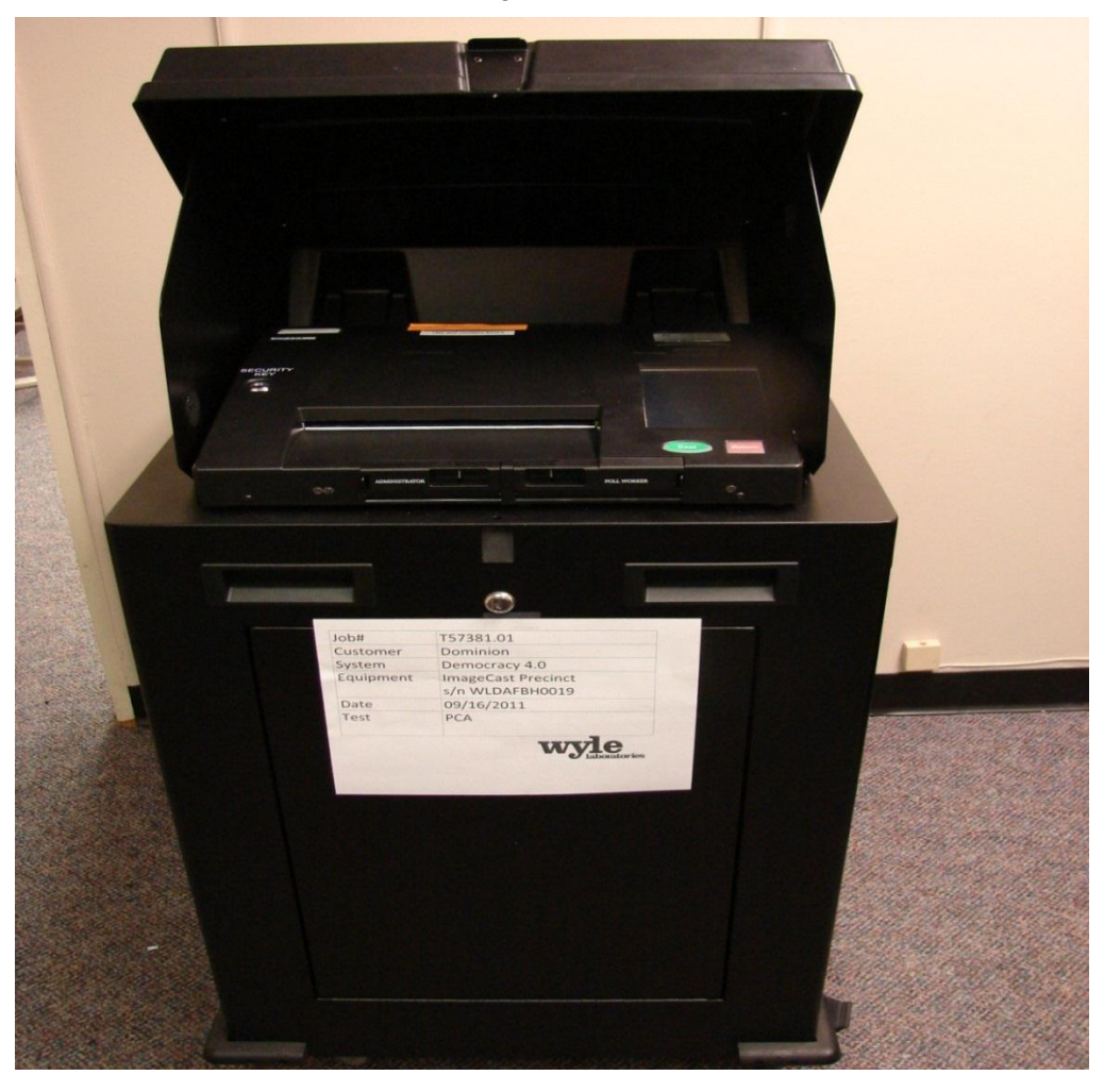
Photograph 2: ImageCast Precinct (ICP)

In addition, enhanced accessibility voting may be accomplished via optional accessories connected to the ImageCast unit. The ICP utilizes an ATI device to allow voters with disabilities to navigate and submit a voted ballot. This is accomplished by presenting the ballot to the voter in an audio format. The ATI is connected to the tabulator, and allows the voter to listen to an audio voting session consisting of contest and candidate names. The ATI also allows a voter to adjust the volume and speed of audio playback. The cast vote record is recorded electronically when the ATI is used to cast a ballot. There is no paper ballot or paper record produced when the ATI is utilized for voting.