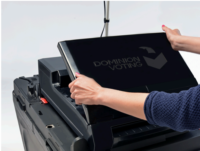
Figure 3.2: Powering up the ImageCast ® Evolution