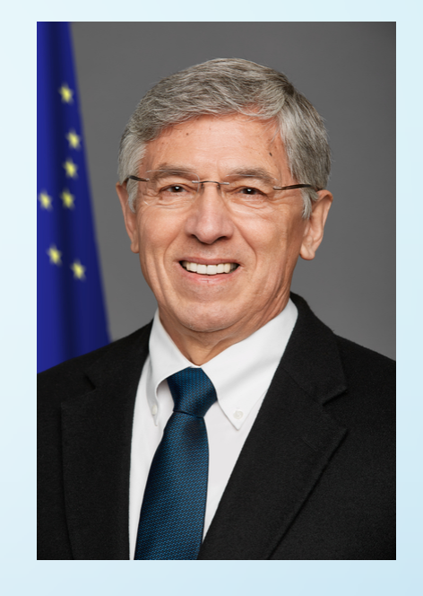
Byron Mallott, Lt. Governor