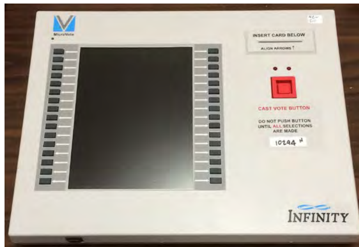
Photograph 1: Infinity Panel

The Infinity Voting Panel is a DRE voting device that presents a visual ballot on an LCD panel with a text-to-speech voice synthesized audio ballot option.