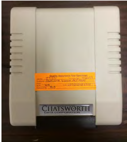
Photograph 2: Chatsworth ACP2200

The functionality of the EMS software Central Count is to support vote capture and tabulation of paper ballots (standard data cards) read by the Chatsworth COTS central count dual-sided ACP2200 OMR.