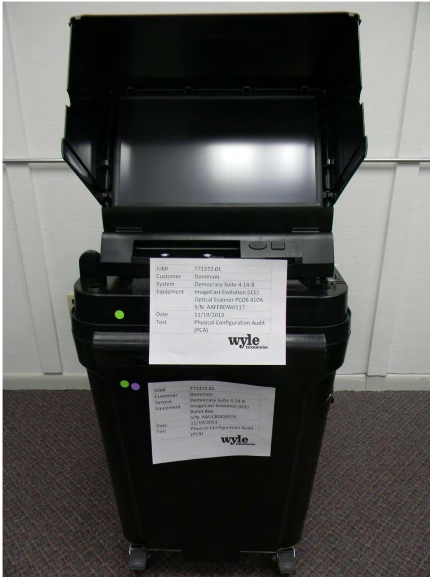
Photograph 1: ImageCast Evolution (ICE) on Plastic Ballot Box

(The remainder of this page intentionally left blank)