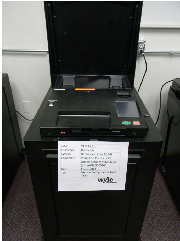
Photograph 2: ImageCast Precinct (ICP) on Metal Ballot Box

In addition, enhanced accessibility voting may be accomplished via optional accessories connected to the ImageCast unit. The ICP utilizes an ATI device to allow voters with disabilities to navigate and submit a voted ballot. This is accomplished by presenting the ballot to the voter in an audio format. The ATI is connected to the tabulator, and allows the voter to listen to an audio voting session consisting of contest and candidate names. The ATI also allows a voter to adjust the volume and speed of audio playback. The cast vote record is recorded electronically when the ATI is used to cast a ballot. There is no contemporaneous paper ballot or paper record produced when the ATI is utilized for voting. A ballot arising from the voter's choices may be printed from EMS at a later time.