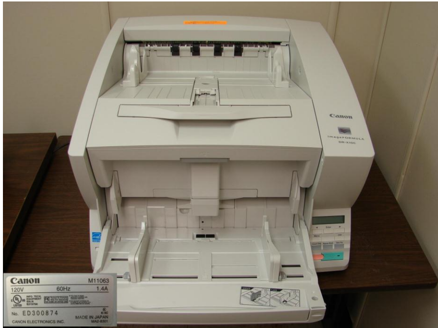
Photograph No. 3 ICC Central Count Tabulator