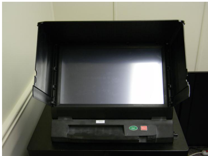
Photograph No. 1 View of ICE Precinct Ballot Tabulator**

The Dominion Democracy Suite ImageCast Evolution system employs a precinct-level optical scan ballot counter (tabulator) in conjunction with an external ballot box. This tabulator is designed to mark and/or scan paper ballots, interpret voting marks, communicate these interpretations back to the voter (either visually through the integrated LCD display or audibly via integrated headphones), and upon the voter's acceptance, deposit the ballots into the secure ballot box. The unit also features an Audio Tactile Interface (ATI) which permits voters who cannot negotiate a paper ballot to generate a synchronously human and machine-readable ballot from elector-input vote selections. In this sense, the ImageCast Evolution acts as a ballot marking device.