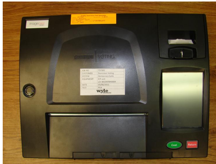
Photograph No. 2 View of ICP Precinct Ballot Counter

The ImageCast Precinct Ballot Counter is a precinct-based optical scan ballot tabulator that is used in conjunction with ImageCast compatible ballot storage boxes. The system is designed to scan marked paper ballots, interpret voter marks on the paper ballot and safely store and tabulate each vote from each paper ballot. In addition, the ImageCast Precinct supports enhanced accessibility voting which may be accomplished via optional accessories connected to the ImageCast unit to produce a ballot for scanning.