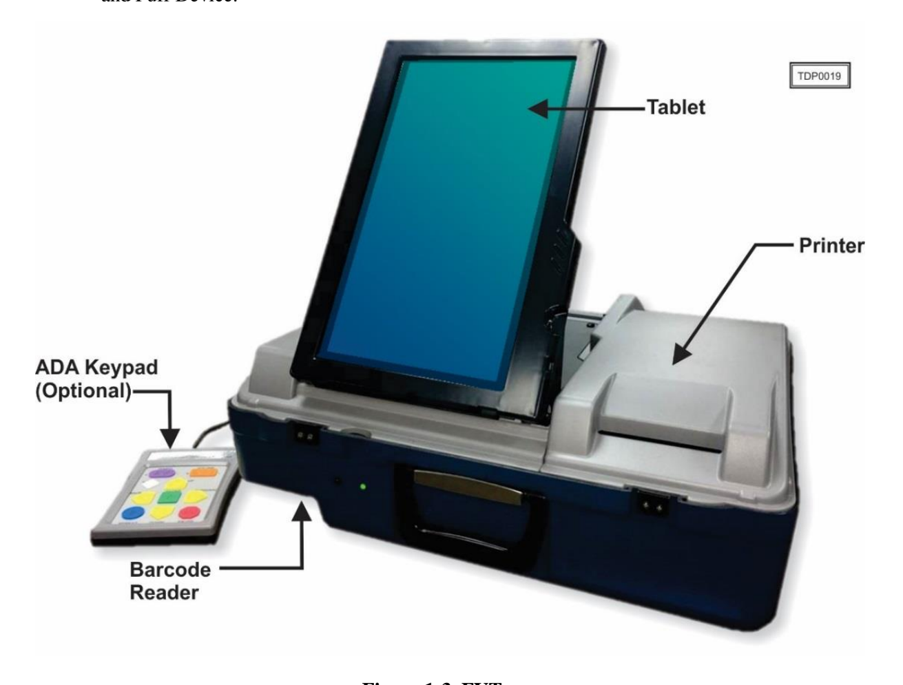
Figure 1-3. FVT