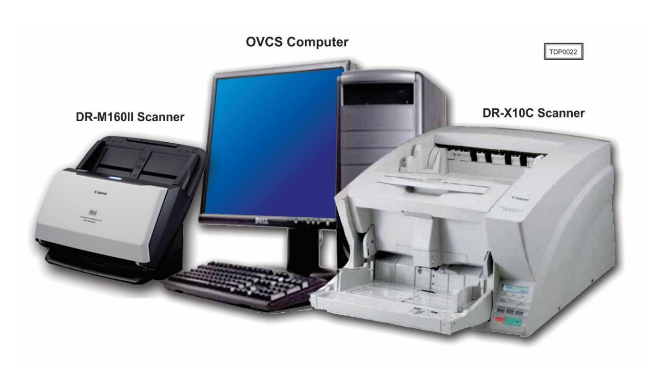
Figure 1-4. OVCS