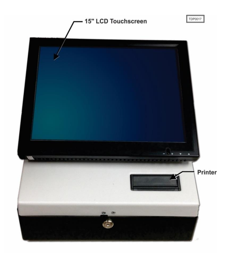
Figure 1-2. OVI