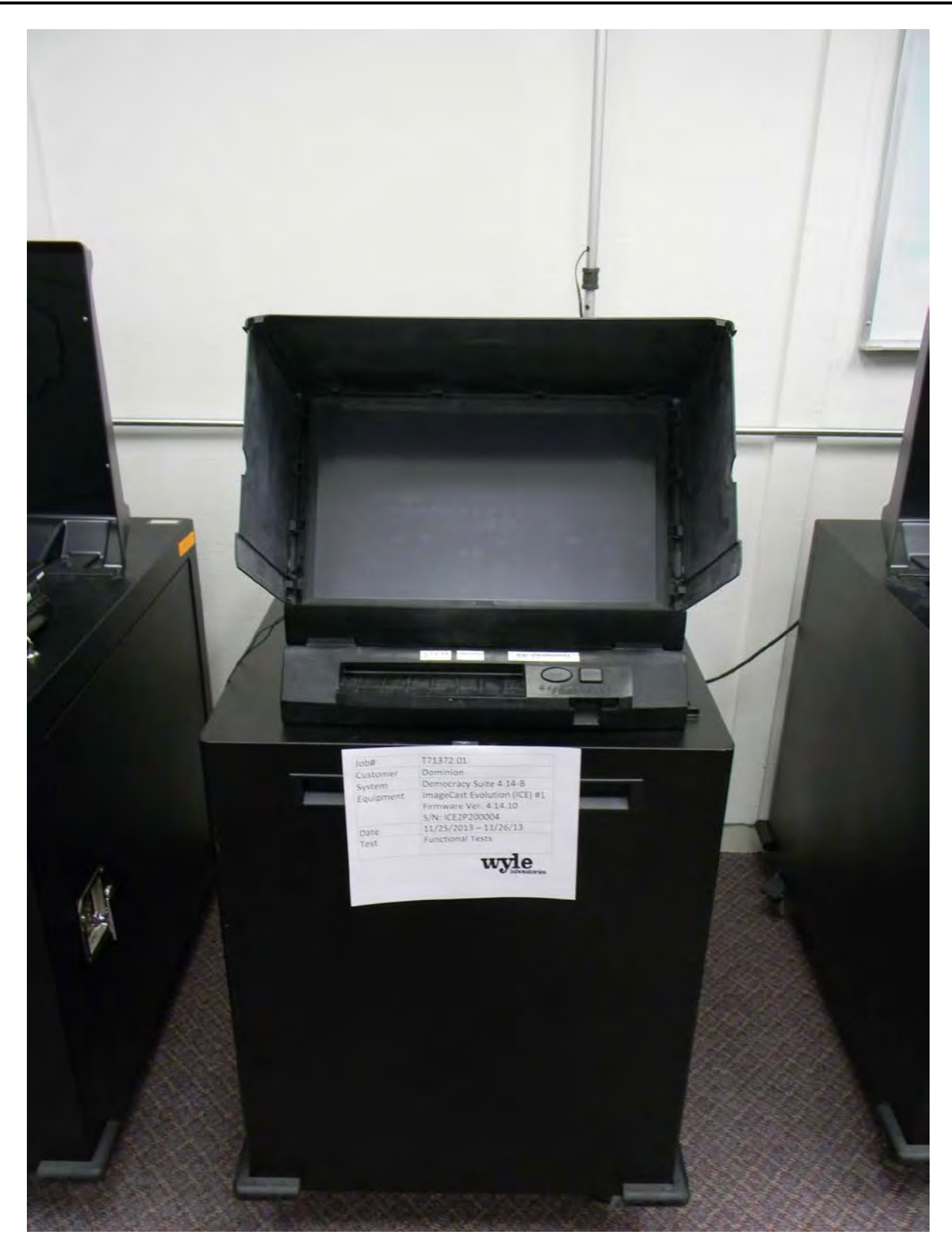
Photograph 1 Functional Tests: ImageCast Evolution #1 S/N ICE2P200004