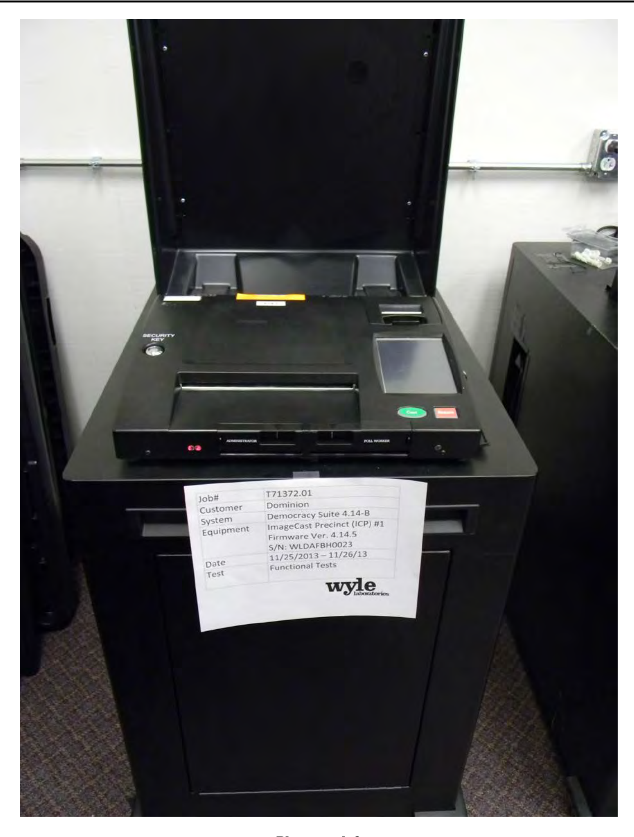
Photograph 3 Functional Tests: ImageCast Precinct #1 S/N WLDAFBH0023