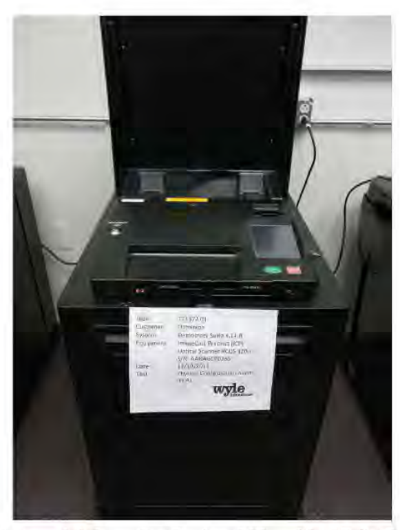
Photograph 2: ImageCast Precinct (ICP) on Metal Ballot Box

In addition, enhanced accessibility voting may be accomplished via optional accessories connected to the ImageCast unit. The ICP utilizes an ATI device to allow voters with disabilities to navigate and submit a voted ballot. This is accomplished by presenting the ballot to the voter in an audio format. The ATI is connected to the tabulator, and allows the voter to listen to an audio voting session consisting of contest and candidate names. The ATI also allows a voter to adjust the volume and speed of audio playback. The cast vote record is recorded electronically when the ATI is used to cast a ballot. There is no contemporaneous paper ballot or paper record produced when the ATI is utilized for voting. A ballot arising from the voter's choices may be printed from EMS at a later time.