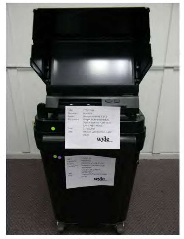
Photograph 1: ImageCast Evolution (ICE) on Plastic Ballot Box

Precinct Ballot Tabulator: ImageCast Evolution (ICE) (Continued)