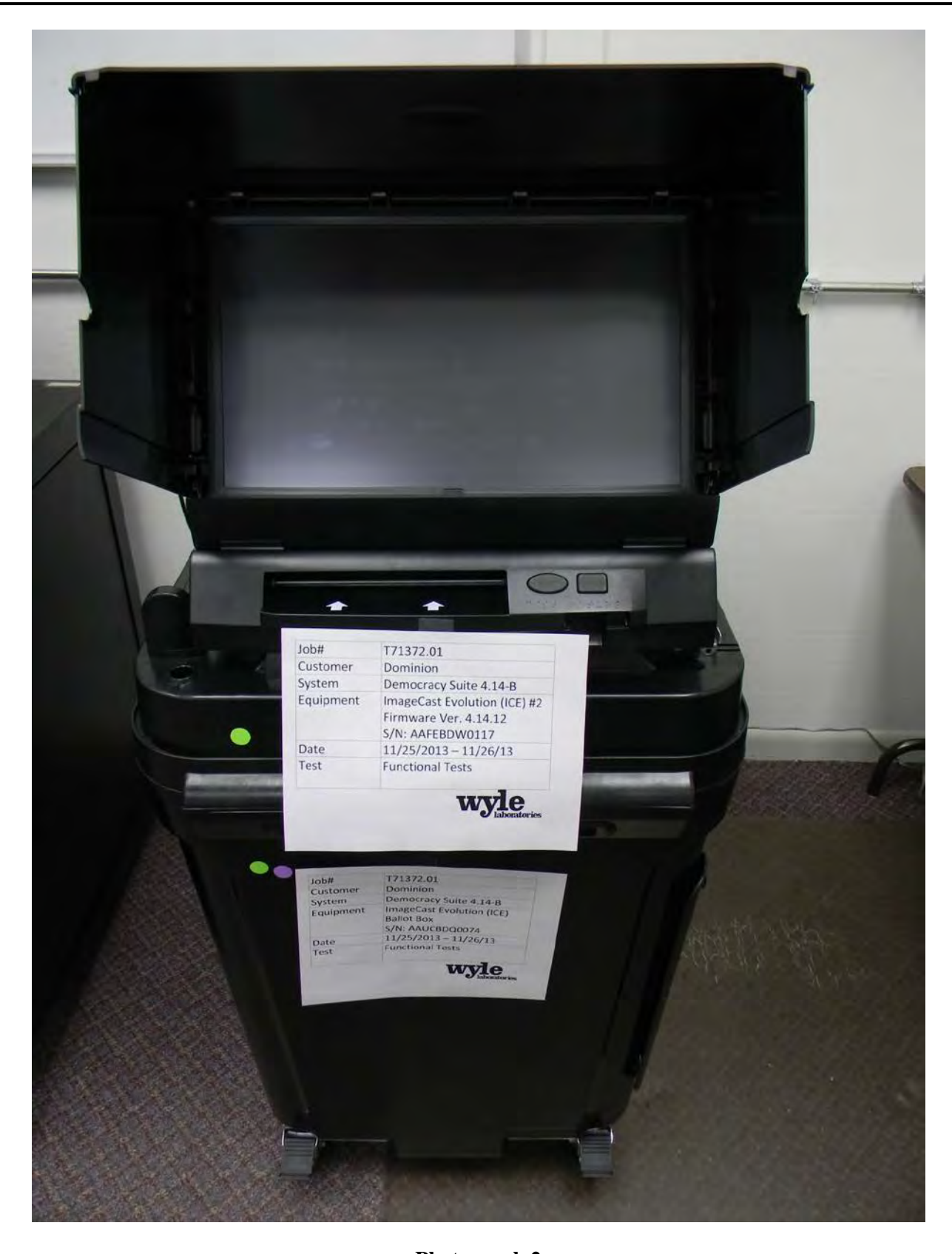
Photograph 2 Functional Tests: ImageCast Evolution #2 S/N AAFEBDW0117 mounted on ICE Plastic Ballot Box S/N AAUCBDQ0074