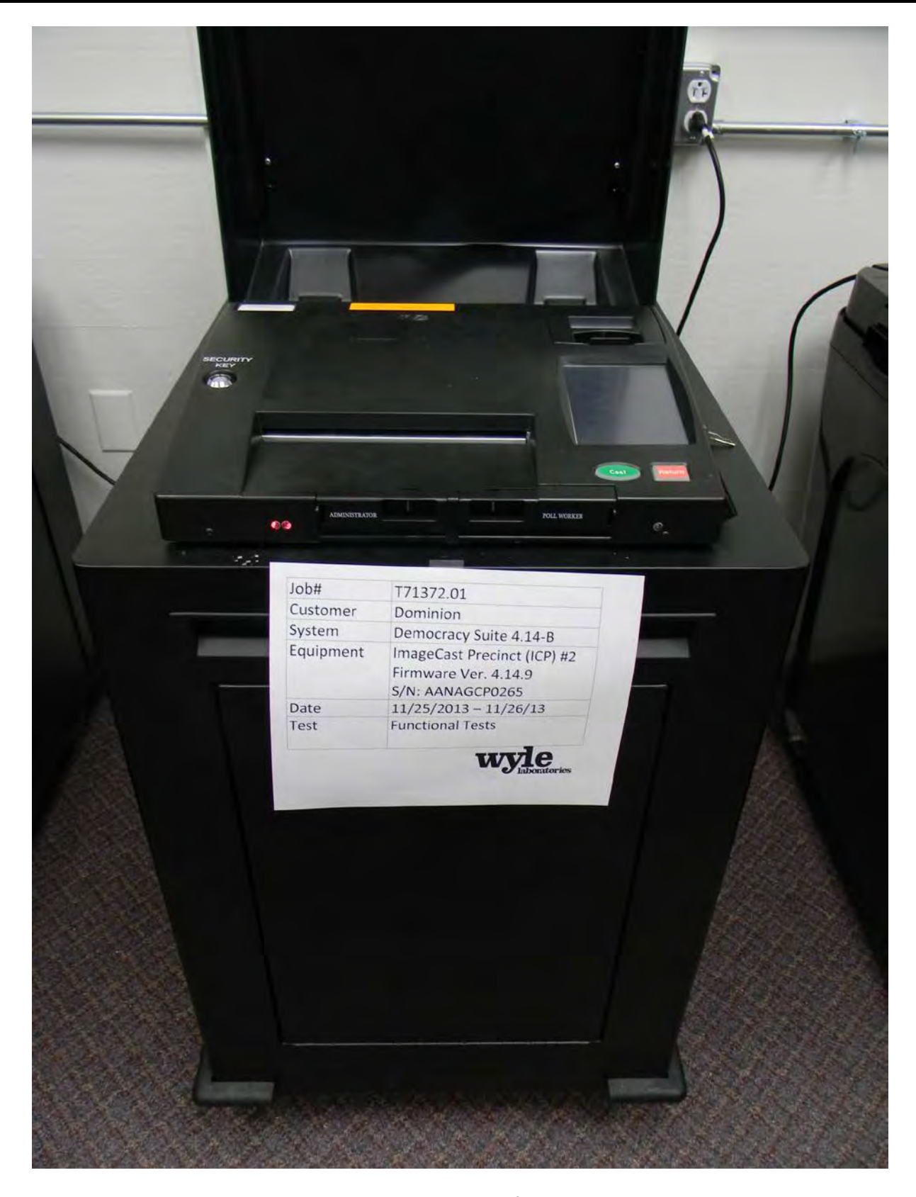
Photograph 4 Functional Tests: ImageCast Precinct #2 S/N AANAGCP0265