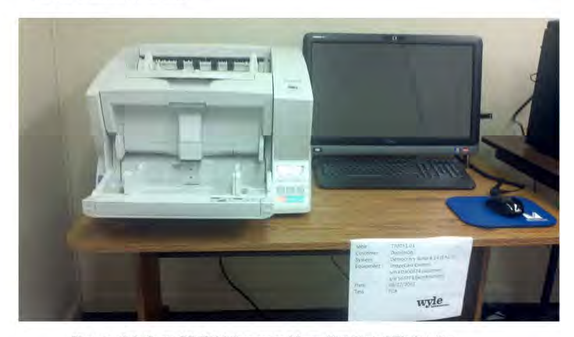
Photograph 3: Canon DR-X10C Scanner and ImageCast Central Workstation

(The remainder of this page intentionally left blank)