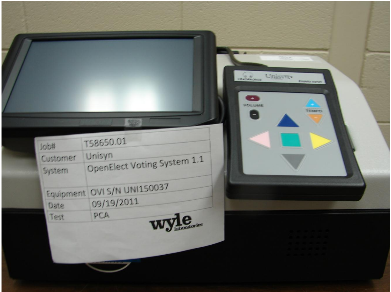
Photograph 2: OVI