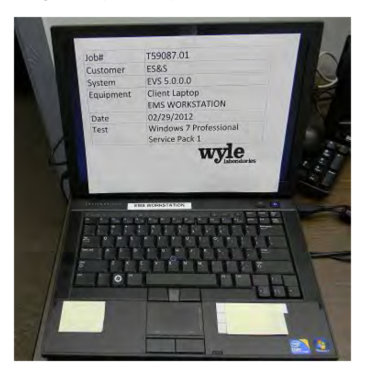
Photograph No. 7: EMS Client Laptop

EMS Client Server Configuration (Continued)