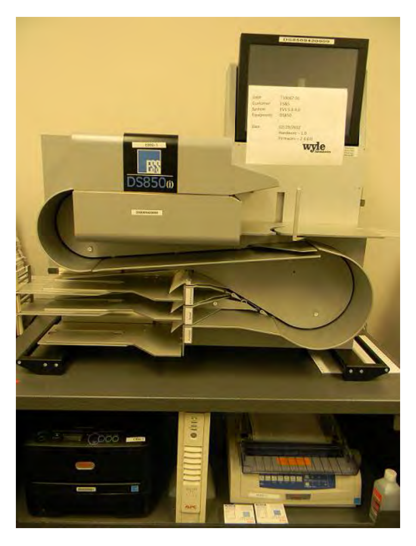
Photograph No. 5: DS850

The DS850 is a high-speed, digital scan central ballot counter. During scanning, the DS850 prints a continuous audit log to a dedicated audit log printer and can print results directly from the scanner to a second connected printer. The scanner saves results internally and to results collection media that officials can use to format and print results from a PC running Election Reporting Manager. The DS850 has an optimum throughput rate of 200 ballots per minute and uses cameras and imaging algorithms to image the front and back of a ballot, evaluate the results and sort ballots into discrete bins to maintain continuous scanning.