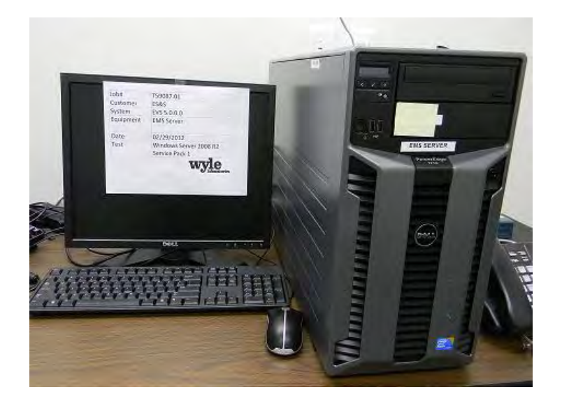
Photograph No. 6: EMS Server

EVS 5.0.0.0 Voting System Election Management System (EMS) will be configured with a Server running Windows Server 2008 R2 and a combination of a client laptop and a client desktop running Windows 7 Professional.