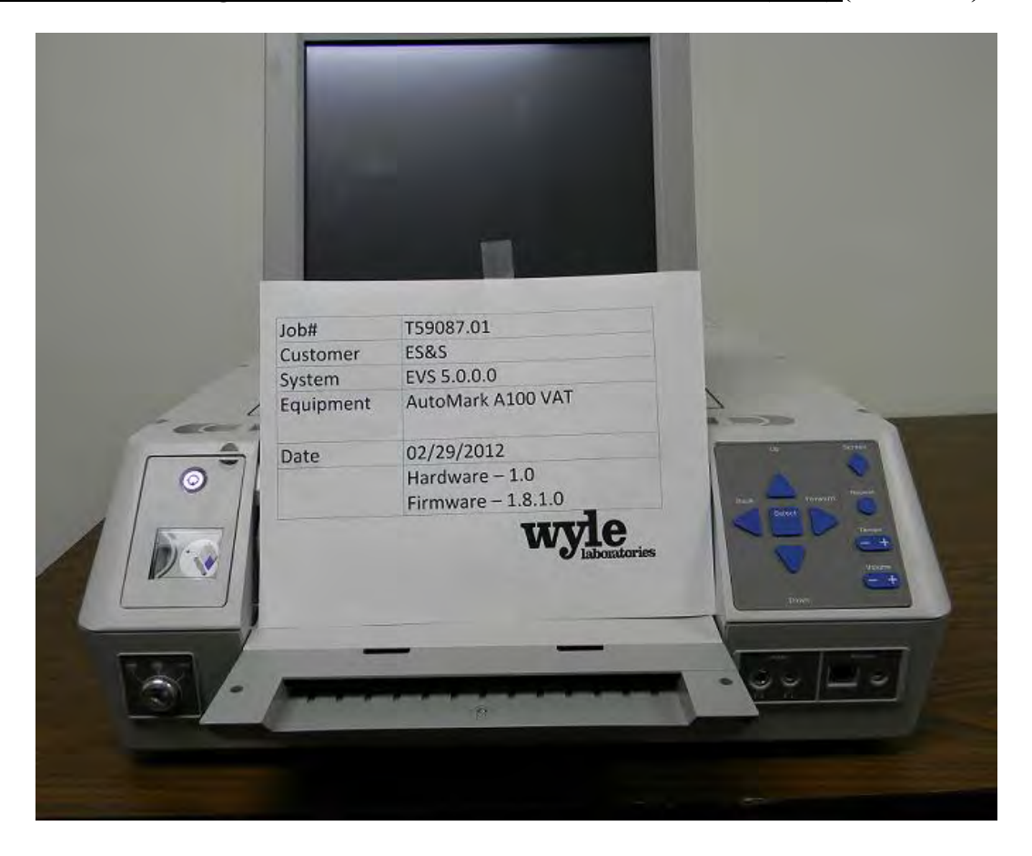
Photograph No. 4: AutoMARK<sup>TM</sup> A100 VAT

Electronic Ballot Marking Device: AutoMARK<sup>TM</sup> Voter Assist Terminal (VAT) (Continued)