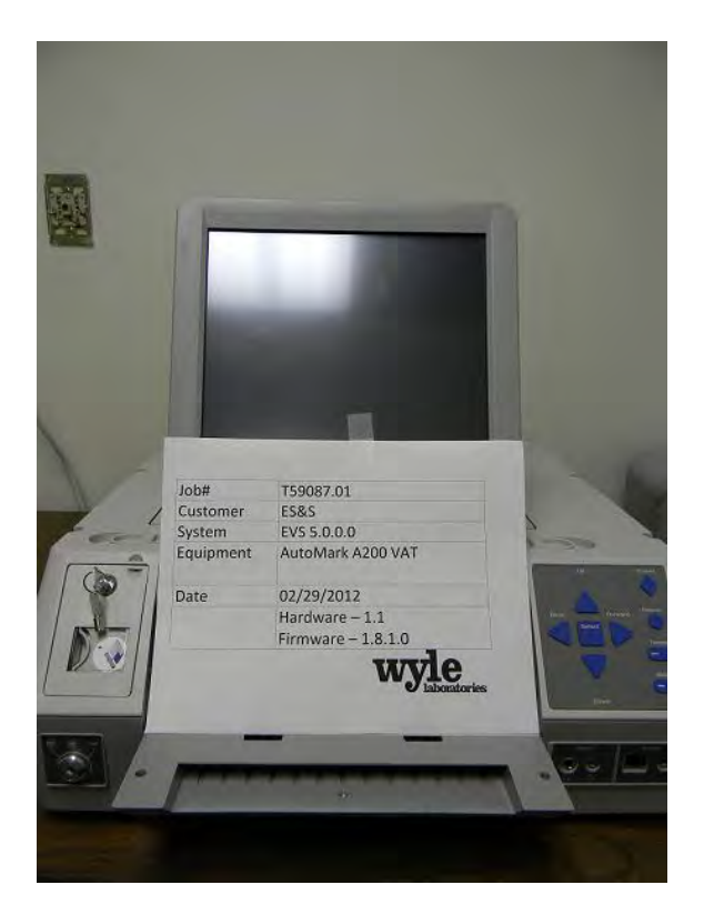
Photograph No. 3: AutoMARK<sup>TM</sup> A200 VAT

The A100, A200 and A300 all operate the same and have the same features. The difference between the models is the location of two printed circuit boards and related wiring harness and cables. In the A200, the Printer Engine Board and Power Supply Board were moved from under the machine to the top. The A300 has a different lock and label. Since this change is so minor, the A300 equipment will not be tested. However, the A300 will be included in the recommendation for certification.