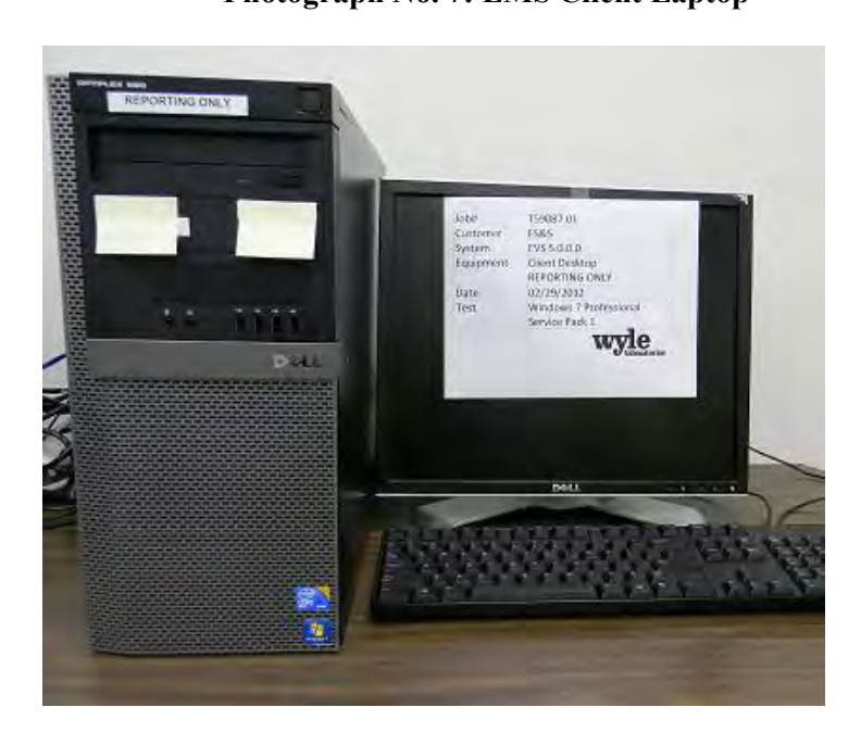
Photograph No. 8: EMS Client Desktop