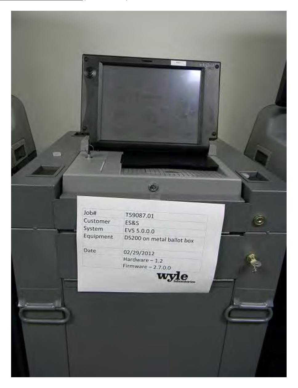
Photograph No. 2: DS200 (on metal ballot box)

Precinct Ballot Tabulator: DS200 (Continued)